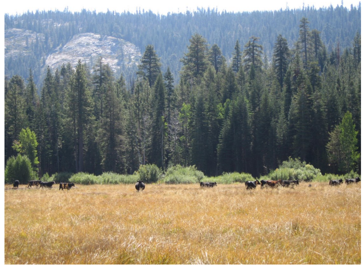
Cattle grazing a mountain meadow on the Plumas National Forest.

In 1999, USFS Region 5 Range Program initiated a long-term meadow condition and trend monitoring program. The primary purpose of the program was to: