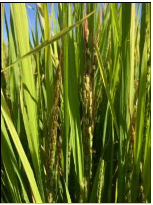
Figure 2. Immature panicle of weedy rice Type 6 in the field. The long reddish awns are clearly visible before maturity.

Cooperative Extension Sutter-Yuba Counties ♦ 142A Garden Highway, Yuba City, CA 95991-5512 Office (530) 822-7515 ♦ Fax (530) 673-5368 ♦ <u>http://cesutter.ucanr.edu/</u>