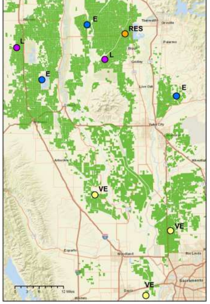
Location of the UCCE and RES variety trials (VE=very early, E=early, L=intermediate/late, RES=Rice Experiment Station)

The trials are conducted at the RES and in grower fields. Onfarm trials are planted in the most appropriate location for the maturity group of the entries, taking into consideration weather but also the field variety of the location to avoid early or late harvesting. Entries in each test were generally restricted to a single maturity group to avoid too early or too late maturation relative to the field variety of the test location.