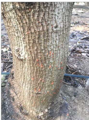
Fire/heat damage exudate