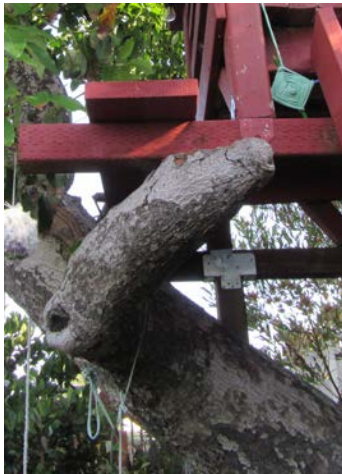
Physical damage from kids clambering around in a tree

https://www.sciencedirect.com/science/article/pii/S0254629911001372 ). Any wound that might be caused by woodpeckers, pickers or little kids climbing the trees will damage the bark, and where the damage has occurred, the sugar will form. So fire damage can cause wounding and so can insect infestation like shot hole borer. Any wound will cause the sugar to leak out in a response to heal the damage. This sugar exudate is a sign of health in the tree, showing that it can respond to attack/infestation/disease. No response is a bad sign.