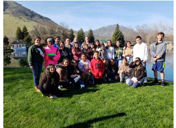
Sixteen youth from five 4-H Clubs attended the 2019 Central 4-H Youth Summit