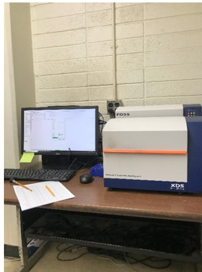
The FOSS NIRS scanning machine at the Forage and Range Research Lab, USDA ARS in Logan Utah, that predicts forage quality components.

There are close to one million acres of native pasture and forestlands in Santa Barbara County, which are collectively referred to as rangelands. Comprising approximately half of the acreage of the County, these lands provide opportunity for multiple purposes. Rangelands serve as watersheds to capture, store, and release water for downstream uses; they provide forage for grazing by livestock; and their diverse plant communities provide habitat for many species of wildlife and recreational uses. The UC Cooperative Extension Watershed and Natural Resource Program provide educational programs to inform people who own and/or manage the land and the animals grazing these lands. This work also includes applied research to develop new knowledge to effectively and efficiently manage rangelands and livestock in today's competitive and regulatory environment.