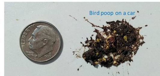
Bird poop on a car

An example of how small the light-sensing area of a pyranometer can be, relative to a dime.