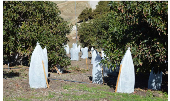
Young Coffee Plants Under Wraps Protected from Frost in an Avocado Orchard