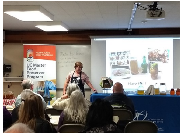
UCCE Master Food Preserver Fermentation Class

Improving our program's visibility in Santa Barbara County is a high priority for our volunteers. Unfortunately, our plan to offer a volunteer training in the area did not happen due to lack of applications. We continue to work on developing multiple strategies for program outreach in the upcoming year. Our volunteer training interest list is growing, and we are hopeful to provide a training in 2020. A significant barrier to offering a training in the Santa Barbara County region is the availability of low-cost rental space with adjacent kitchen facilities in the southern section of the County. While searching for a facility which will meet our needs and budget, we continue to reach out to the community to intensify interest in volunteering. Through expansion of our group of volunteers in Santa Barbara County, we will be able to increase programming in the region as well.