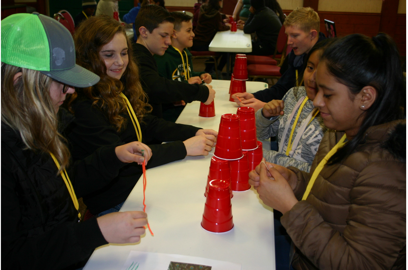
4-H Members from Santa Barbara County attended the 2019 Youth Leadership Summit