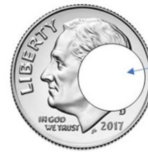
Diameter of the sensing area of a pyranometer, relative to a dime

The recent problems of the Boeing 737 MAX aircraft have been associated with erroneous values from a single sensor leading to failure of the system (i.e. airplane crash). This unfortunate outcome serves as a reminder that very smart and capable teams of people can inadvertently design systems that may be prone to unexpected failure when provided with erroneous data. It would be helpful to look at the systems that we use in agriculture with a critical eye to understand if any of them may also be prone to unexpected failures if key components fail. One example of such a weakness can be in the weather station data that is used to calculate evapotranspiration values for irrigation management. This calculation requires measurements of air temperature, humidity, wind speed, and solar radiation. The latter measurement has the largest influence in the final value, and hence errors in the solar radiation measurement can lead to very inaccurate evapotranspiration values. The sensor used to measure the solar radiation is called a pyranometer; the part of the sensor that actually measures incoming solar radiation is quite small, about the diameter of a small chocolate chip. How might this small sensor be vulnerable? One potential source of error is from a bird dropping that falls on the sensor and partially reduces the reading, resulting in lower evapotranspiration values than truly exist in the field. This example was recently addressed at a Vineyard Irrigation conference at UC Davis.