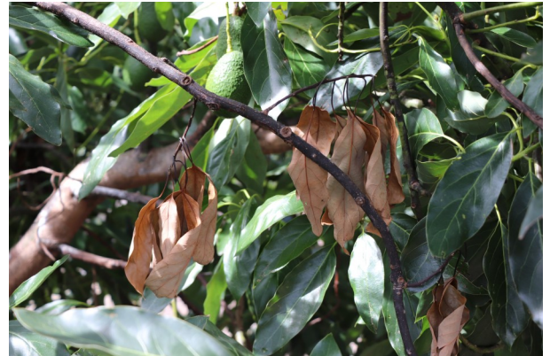
Typical symptoms of avocado branch canker demonstrating dieback of the shoot and leaves, progressing from the tip of the shoot toward the main branch or trunk.

Growers of agricultural crops throughout California face ever increasing challenges related to pest management through the introduction of invasive pest species, increased production costs, changing federal and state laws and regulations, and consumer preferences. Ecosystem-based strategies for agricultural pest management that are developed and validated through local field research and evaluation, disseminated through effective educational opportunities, and adopted on a regional or areawide scale are essential to maintaining economic viability of agricultural crops. Integrated pest management is a decision-making strategy that focuses on long-term prevention of pests or their damage through a combination of techniques such as biological control, habitat manipulation, modification of cultural practices, and use of resistant varieties. Pesticides are used only after monitoring indicates they are needed according to established guidelines, and treatments are made with the goal of removing only the target organism. Pest control materials are selected and applied in a manner that minimizes risks to human health, beneficial and nontarget organisms, and the environment.