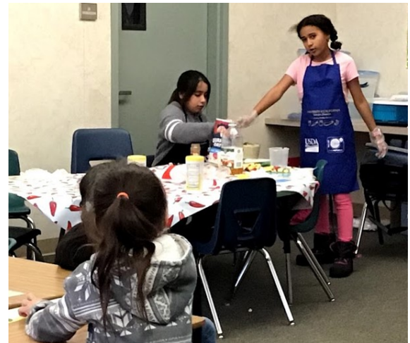
4-H SNAC Students teaching a 2nd grade class how to make a healthy oatmeal breakfast.

Lastly, UC CalFresh continued to support 80 teachers and 3800 students with comprehensive nutrition education service at five school sites in the Santa Maria-Bonita School District and one school site in Lompoc. The teachers received No-Prep Nutrition Education curriculum kits. Students in grades Kindergarten through 6th participated in cooking demonstrations led by UC Community Education Specialist and SNAC youth leaders during this quarter.