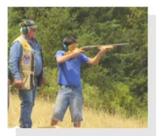
Lake and Mendocino Counties