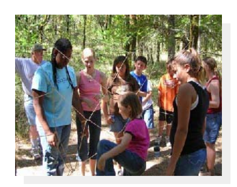
Kern County Butte County California 4-H