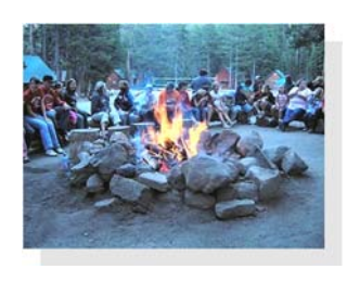
San Joaquin County

Never leave a campfire unattended and always put a campfire out by drowning it with water.