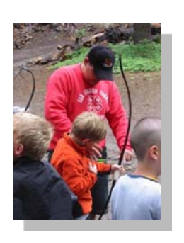
San Joaquin County