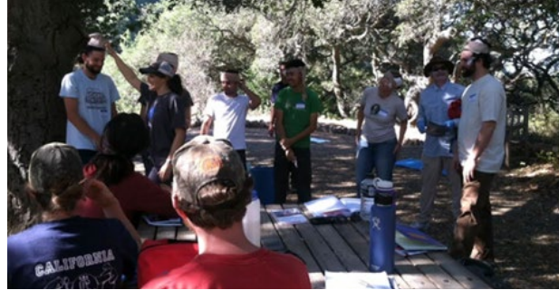
WFA training at UC Botanical Garden