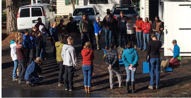
WFA training at UC Merced's Yosemite Field Station

Wilderness First Responder (WFR) course are both taught at numerous UC campuses. Other training providers within California include Sierra Rescue , Wilderness Medicine Associates , and Foster Calm . For trip leaders, field scientists, or students that plan to pursue a career doing outdoor work, WFR training is highly-regarded professionally and will prepare individuals to manage a broad-range of emergency situations, illnesses, and injuries.