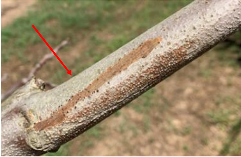
Photo 11. Freeze damaged limb from a Yuba City Howard orchard on June 6, 2019. Note raised “bumps” on bark and black pycnidia (see arrow) that produce spores below bark typical of Bot and Phomopsis.