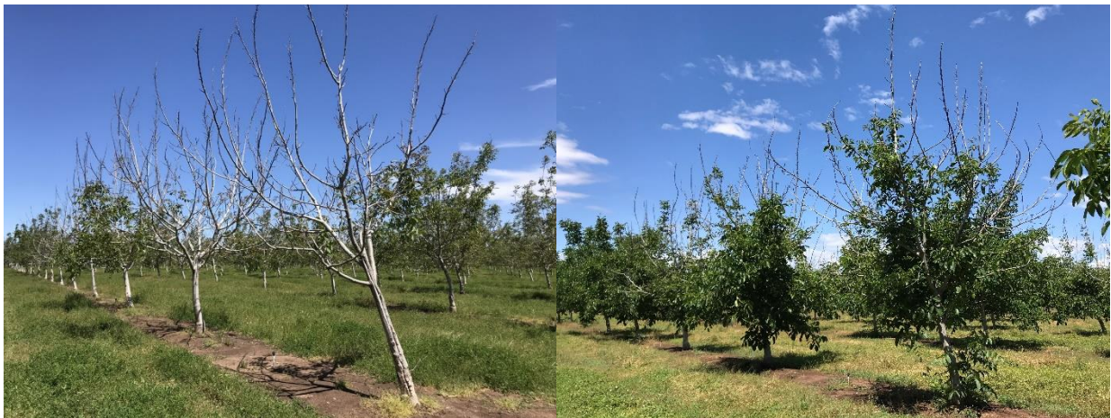
Photos 5 & 6. Clusters of severely affected trees that did not leaf out on April 22 nd (photo 5). Substantial canopy growth from the lower/central portion (photo 6) of most of the affected trees in this orchard on May 31 st.