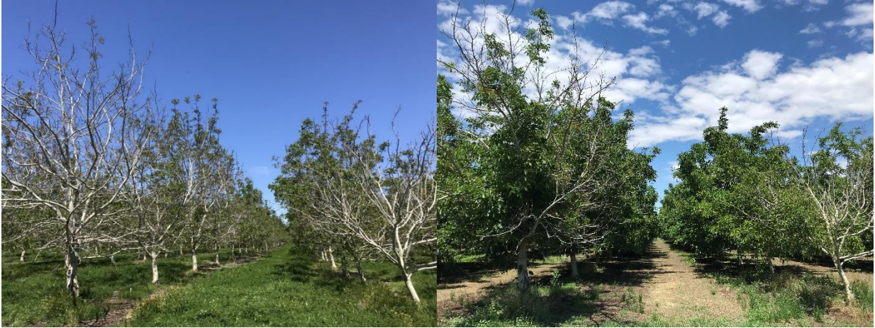
Photo 3 & 4. Two trees with very little leaf out at the edge of a Chandler orchard northwest of Chico, CA on April 22 nd (photo 3). Significant canopy development (photo 4) of the same two trees on May 31 st.