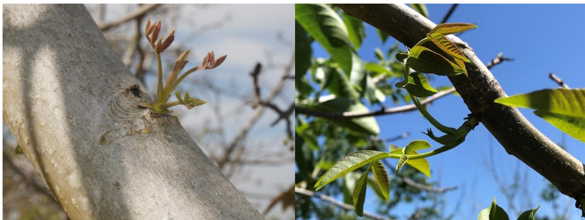
Photo 7 & 8. On otherwise blank branches, some adventitious buds were beginning to push on this Howard tree on April 19 (photo 7). These adventitious buds have continued to break (photo 8) much more recently (photo May 31 st ).