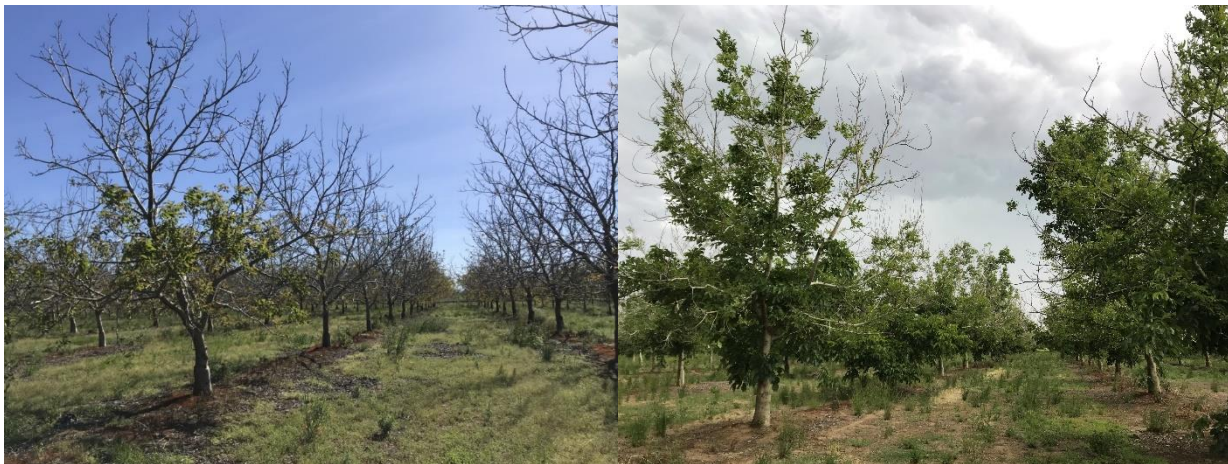
Photo 1 & 2. Very little leaf out in this part of a Gridley, CA Chandler orchard on April 22 nd (photo 1). Significant canopy development in the same orchard by May 30 th.

In late May, we revisited many of the same orchards that we had been called out to a month before (photos 1, 3, and 5). The previously mentioned adventitious buds held in reserve on tree limbs and trunks allowed for regrowth following dieback from the cold injury as seen in late May in photos 2, 4, and 6. These adventitious buds are continuing to break (photo 8).