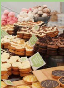
LA County Food Fair