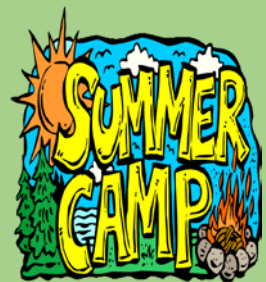
Summer Camp Staff App's Due