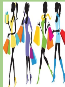
LA County Fashion Revue