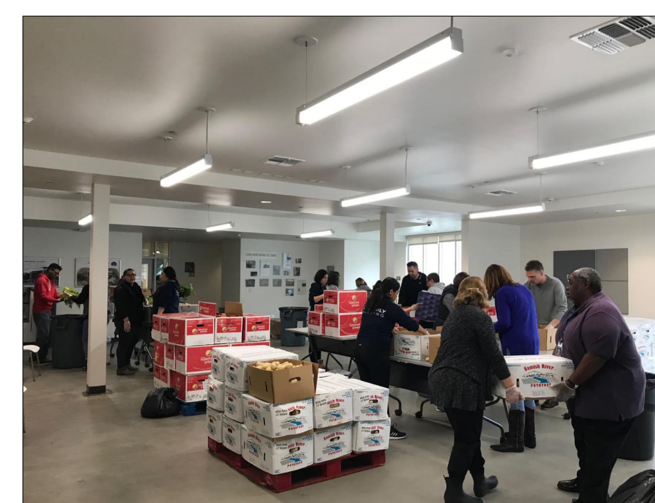
Food distribution at LA Family Housing

Policy Recommendations and Future Research. There are a number of policy advocates and analysts associated with UC ANR who are in positions to make policy suggestions aimed at improving basic needs issues in California. Some policy recommendations and suggestions for future research are briefly described below.