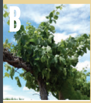
Figure 4. Symptoms of Eutypa dieback, caused by the fungal pathogen Eutypa lata and several other Diatrypaceae species, are characterized by distorted and chlorotic leaves and short internodes (A) and by wedge-shape cankers (B).