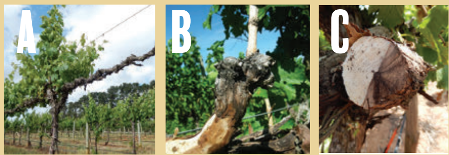
Figure 3. Botryosphaeria dieback, commonly known in California as ‘Bot canker’ is caused by multiple species in the Botryosphaeriaceae family. Characteristic symptoms are the lack of spring growth of infected areas, including cordons (A) or spurs (B). Cross sections of infected parts reveal a wedge-shape canker (C). The GTD disease known as Phomopsis dieback and primarily caused by the fungus Phomopsis viticola shows very similar symptoms as Botryosphaeria dieback.