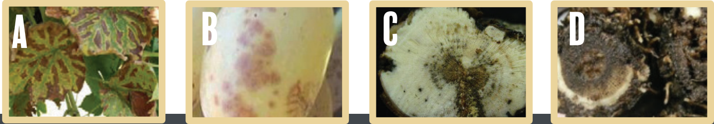
Figure 1. Leaf (tiger stripes) (A), fruit (black measles) (B) and vascular (C) symptoms caused by esca disease complex. Esca (black measles) and petri disease are primarily caused by the vascular pathogens Phaeoconiella chlamydospora and Phaeoacremonium minimum , which are also involved in Petri disease in young plants (D).