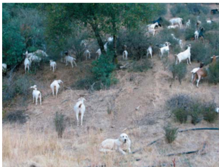
Figure 1. Goats grazing brush with livestock guardian dog (from Nader et al., 2007)