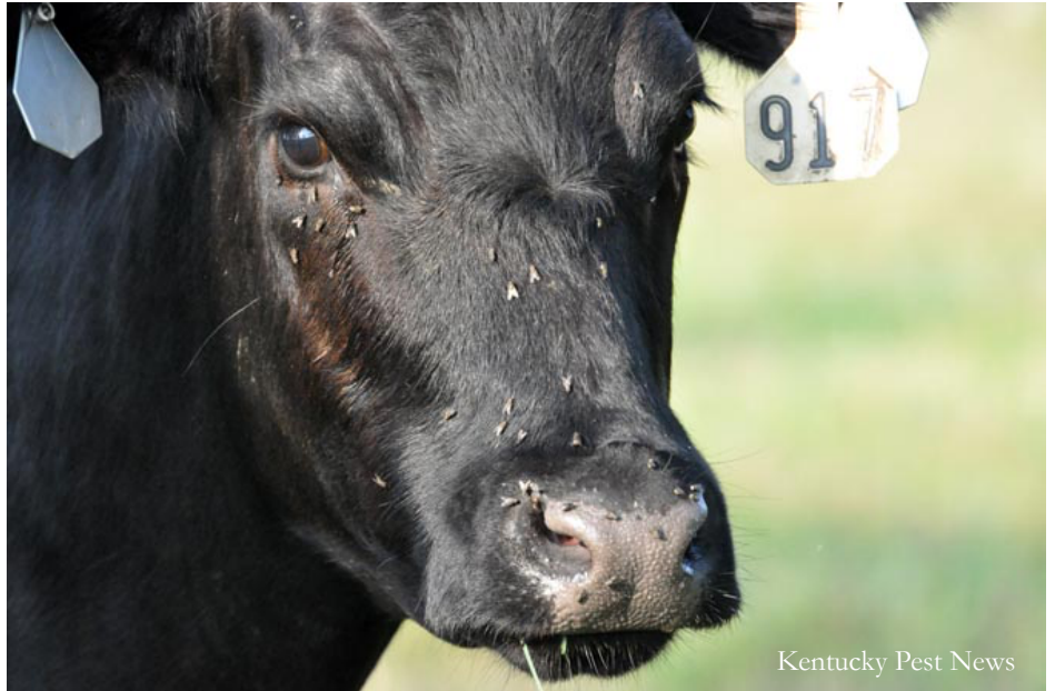
Kentucky Pest News

Economic Impact of Horn Flies: UC research in 1968 found cattle with horn flies spent more time in the shade fighting flies rather than grazing. To determine how much effect this had on weight gain, groups of cow/calf pairs were split into treatments of fly control and no fly control. The calves receiving fly control gained an average of ½ lb/day more than those receiving none (Loomis et al., 1969). Another trial suggested that each 100 horn flies per cow can decrease the calf's weaning weight by 17.9 lbs (Steelman et al., 1991). Similar yearling steer and heifer gain reductions have also been documented (DeRouen et al., 2003). In neither calves nor yearling cattle have compensatory gains been the norm, meaning these weight gain losses seem to follow fly infested cattle through their production life (Quiesenberry and Strohbehn, 1984). It is notable that in some areas, and in some cases with the Brahma breed, it has been found that some cattle are unaffected by fly levels, but in general, heavy fly infestations significantly decrease production. How do horn flies cause cattle to gain less weight? Their painful bites elevate cattle cortisol levels, lessen cattle ability to retain nitrogen, and reduce water consumption, grazing and mastication efficiency (Harvey and Launchbaugh, 1982; Byford et al., 1992).