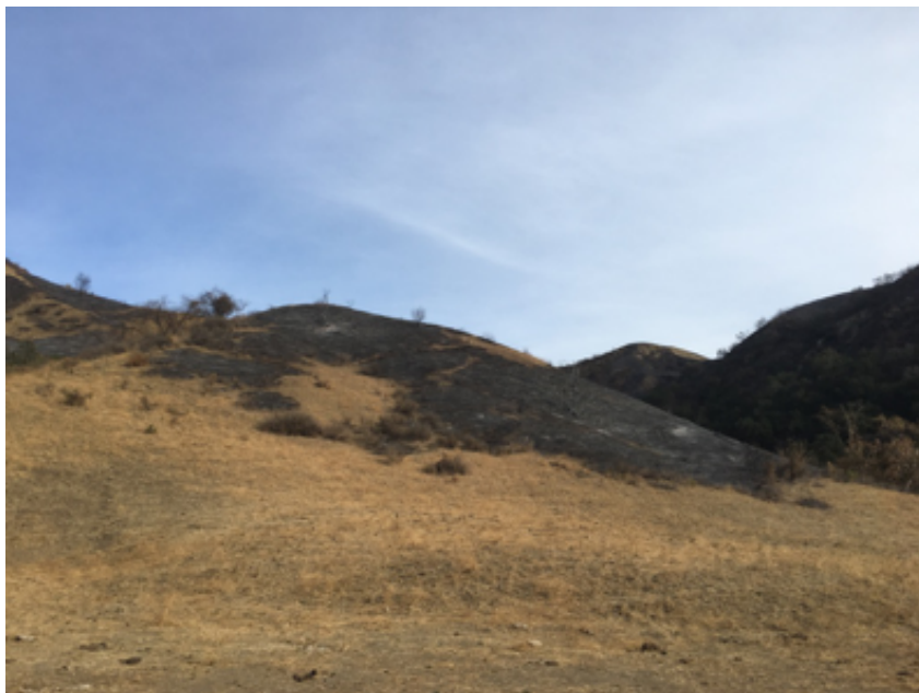
Figure 2. Ranch outside of Ojai Valley that burned during the Thomas Fire, December 2017. Note areas of grazed grassland that remained unburned and areas of shrubland that burned at high intensity.

Furthermore, as a state we should consider how traditional grazing might be expanded to further reduce fuel loading. As one example, we might encourage again grazing in our National Forests, which have seen a precipitous decline in stocking rates over the last sixty years. Fully half of the one hundred allotments in the Los Padres National Forest in southern California, for example, representing ~400,000 acres, remain empty (largely due to the bureaucratic hurdles of complying with NEPA—the National Environmental Policy Act; as an aside, if Congress and the US Forest Service could figure out how to streamline NEPA’s environmental review process in a way that would still comply with the spirit of the Act, hundreds of allotment permits could be re-issued and hundreds of thousands of acres could again be treated with regular cattle, sheep, and goat grazing, which would substantially improve the state’s fuel loading).