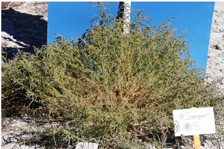
“Immigrant” variety of forage kochia, developed at the Plant Materials Lab in Utah.