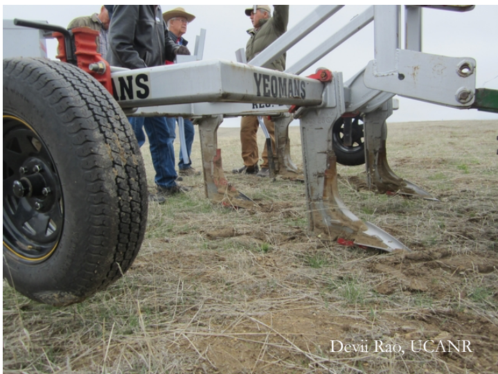
Detail of Yeoman's plow from UCCE workshop in December 2015 in San Luis Obispo. Shanks are long, thin and when operated have limited soil disturbance.

USDA. This relationship is allowing us to trial some new forage species that were initially developed in Utah, to determine their vigor and potential usefulness on the Central Coast of California. We are most excited about “forage kochia” ( Kochia prostrata ), which has been shown to increase forage nutritional value, carrying capacity, and livestock performance on rangelands throughout the semiarid West. It is a sub-shrub—not a grass—that is quite palatable to cattle. Furthermore, because of its later-season growing habit, it serves as an excellent buffer from wildfires because it stays greener longer through fire season. Royce and I have three trial location in San Luis Obispo and Ventura Counties, and our plan is to monitor germination, establishment, biomass production, and palatability to livestock. We should have more to report Spring 2020.