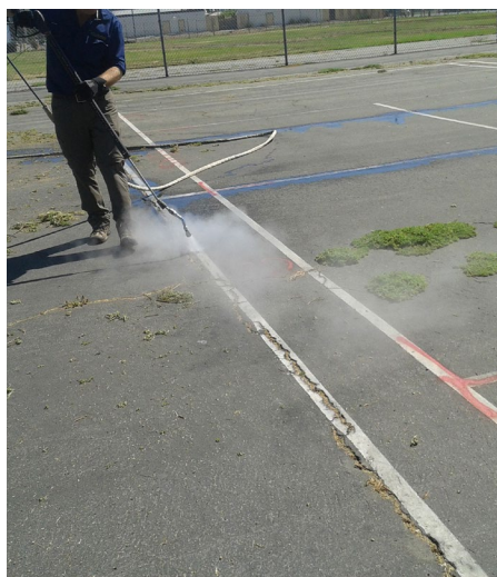
Figure 6. Pressurized steam being used to kill weeds growing in cracks in a school playground.