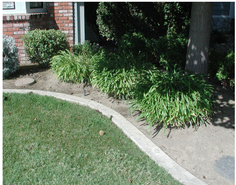
Figure 2. Concrete mowing strip separates turfgrass from ornamental beds.