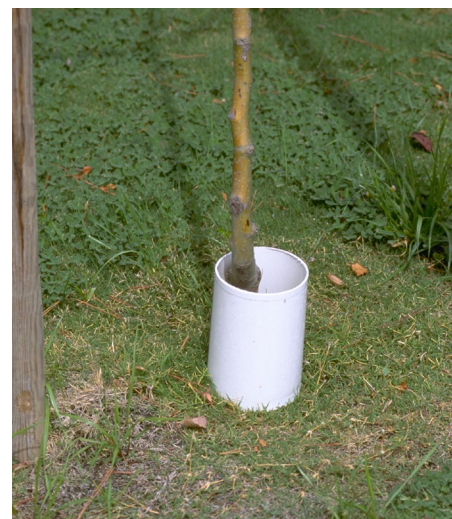
Figure 7. Plastic guard around young tree to protect trunk from damage by string or weed trimmer.

flammable materials, or near buildings. Don't get the flame near desired plants.