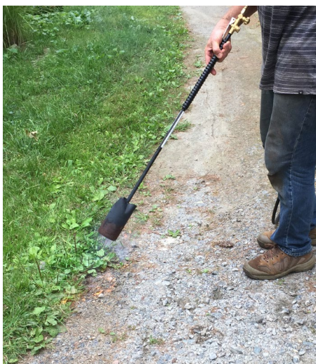
Figure 5. Flame weeders can be used in small areas such as along paths or for weeds between pavers.