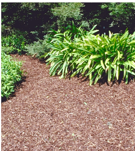
Figure 8. Organic mulch composed of shredded bark.

and have moderate to good ability to withstand decomposition, while bark nuggets are larger in size ( \frac{1}{2} to 1\frac{1}{2} inches) and have excellent stability over time. All of these can be used in landscape beds planted with herbaceous or woody ornamentals. Larger mulch pieces (greater than 1\frac{1}{2} inches) do not provide good weed control unless applied very thickly (often 6 inches or deeper) because the space between the pieces allows light to penetrate and weeds to grow through.