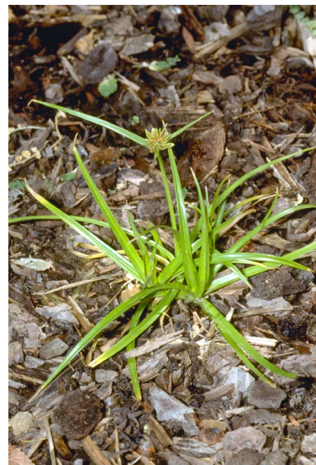
Figure 3. Yellow nutsedge growing through a shallow layer of mulch.

Weeds are sometimes introduced in the soil brought to the landscape site, either when amending the soil or in the potting mix of transplants. Specify certified amendments (US Composting Council Seal of Testing Assurance Program: compostingcouncil.org/seal-of-testing-assurance/ ) and check new plants for weeds, especially perennials like purple and yellow nutsedge (Figure 3) or field bindweed. Annual weeds can be removed by hand before