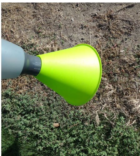
Figure 10. Shielded sprayer.