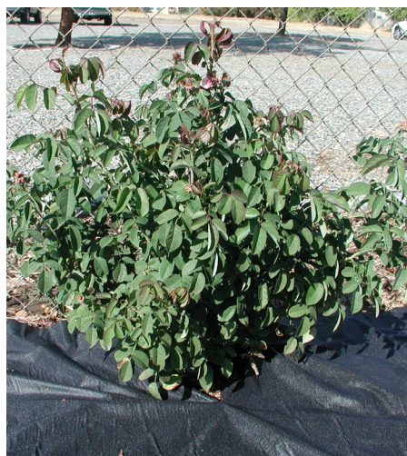
Figure 9. Landscape fabric mulch placed round an ornamental plant. This will be followed by a layer of shredded bark mulch.

If the mulch is too decomposed, it becomes a means of weed propagation rather than a means of prevention. Plan to periodically replenish organic mulches, regardless of particle size, because of decomposition, movement,