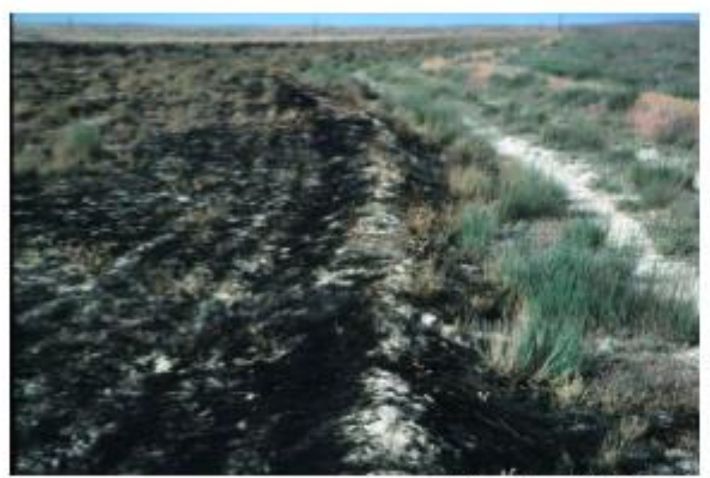
Forage kochia firebreak