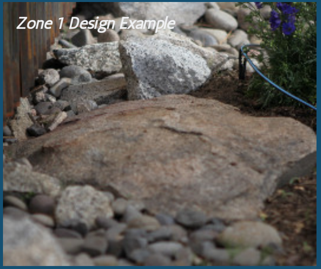
Zone 1 Design Example