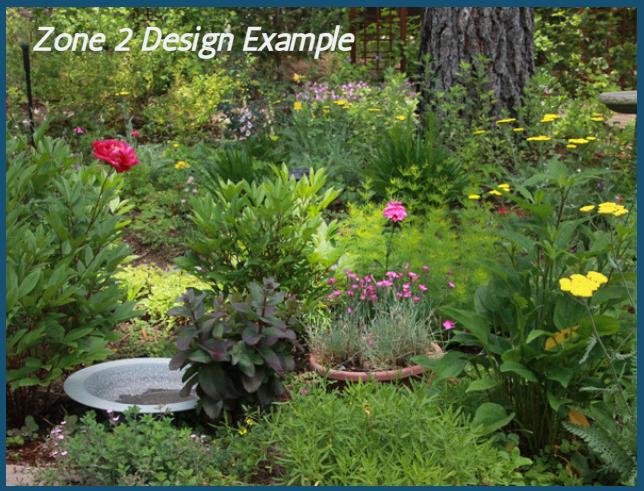
Zone 2 Design Example