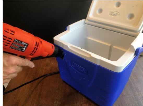
45° angle to drill front hole