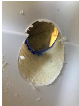
Inside view of front hole