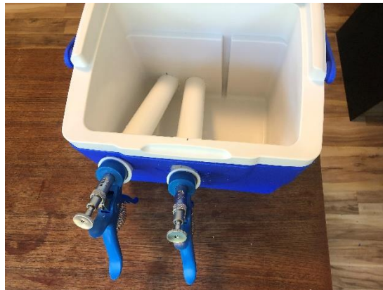
Two holsters in place