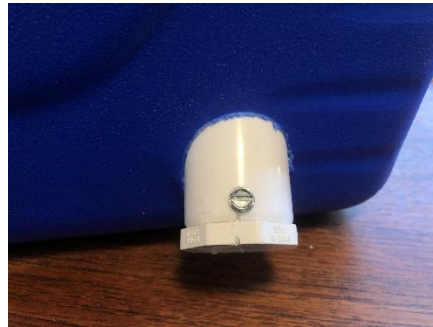
Fasten cap with small screw