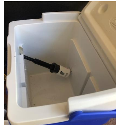
Drill back hole