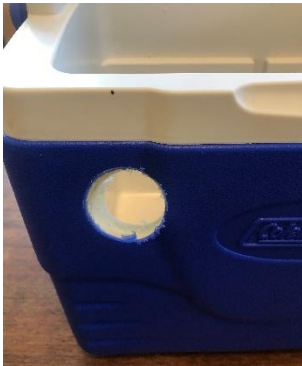
Drilled front hole