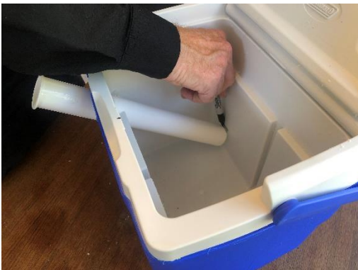
Mark position of back hole