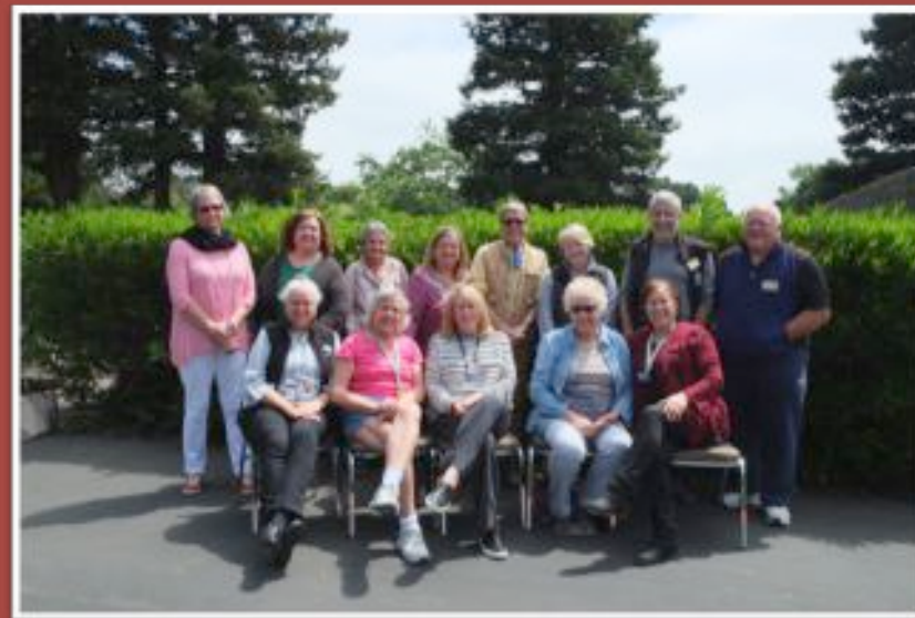
2019 Tomato Sale Team Chairs