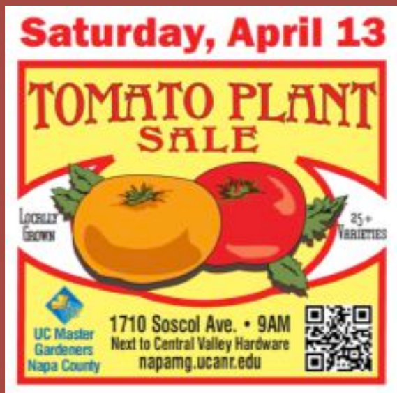
Newspaper Sticky Note Ad

We put out lawn signs in our yards, banners on corners and drove around with signs on our cars. We had flyers out at our workshops, the libraries, businesses. And ... We told our friends and neighbors!