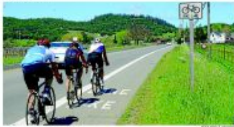
100% of Nevada's...