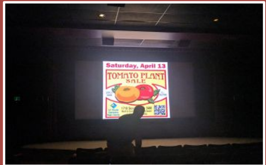
Cameo Theatre Ad