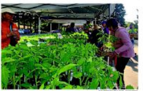
Customers look at tomatoes best used in soups and omelets at the Tomato Plant Sale in Napa.

The public six hundred shoppers came in the first hour and registers handled a transaction per minute. "The tomato sale, it's a wild ride!" she said. "It's like an artery can, for as long as you can."