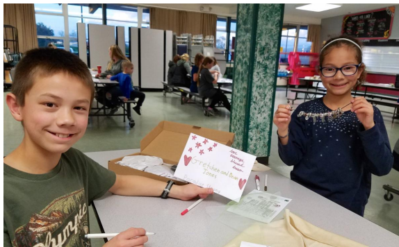
Butte County 4-H'ers work together at a team building session on March 27, 2019 in Chico, California.