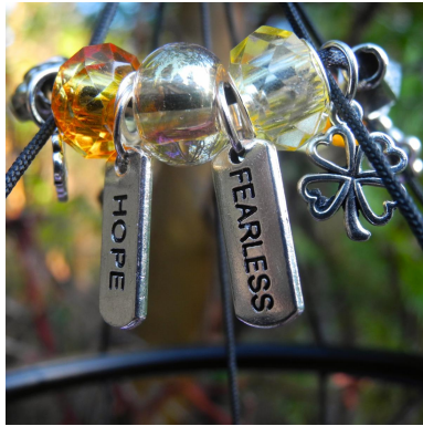
Examples of some of the beads and inspirational words selected for the wind chimes.