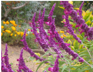
Salvia leucantha Mexican bush sage