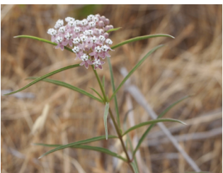
Asclepias species milkweed