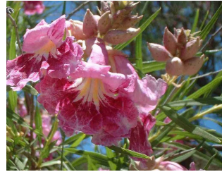
Chilopsis linearis cultivars desert willow