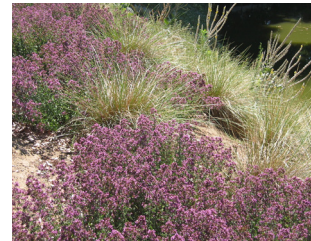
Origanum species and cultivars oregano