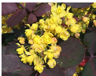
Berberis aquifolium cultivars Oregon grape