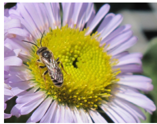
Erigeron 'W.R.' Wayne Roderick's seaside daisy