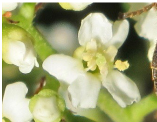
Heteromeles arbutifolia toyon