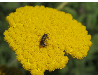
Achillea 'Coronation Gold' yarrow