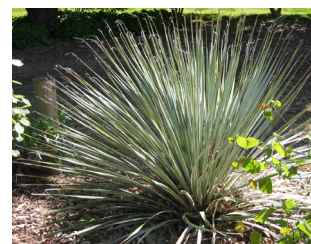
Dasylirion wheeleri desert spoon