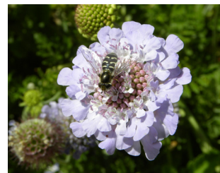
Scabiosa 'Butterfly Blue' butterfly blue pincushion flower