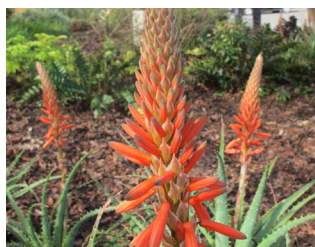
Aloe x spinosissima gold tooth aloe