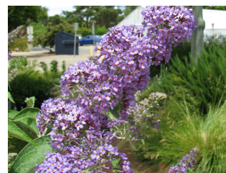
Buddleja dwarf cultivars butterfly bush