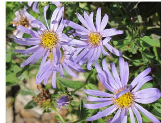
Aster x frikartii 'Mönch' mönch aster