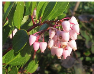
Arctostaphylos densiflora 'Howard McMinn'