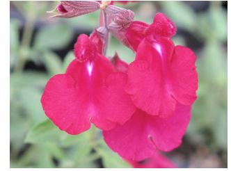
Salvia greggii cultivars autumn sage