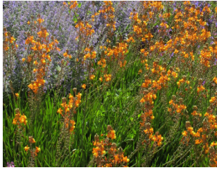
Bulbine frutescens Cape balsam