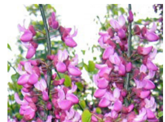
Cercis occidentalis western redbud