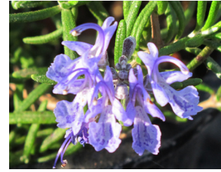
Rosmarinus officinalis , cultivars rosemary