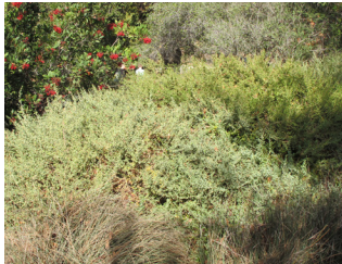
Baccharis pilularis 'Pigeon Point' Pigeon Point coyote bush