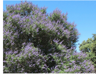
Vitex agnus-castus 'Shoal Creek' Shoal Creek chaste tree