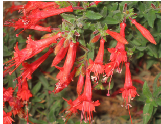
Epilobium californicum cultivars California fuchsia