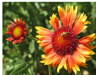
Gaillardia x grandiflora blanket flower