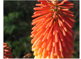
Kniphofia species, hybrids and cultivars poker plant