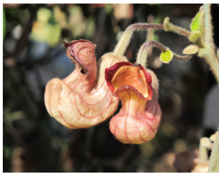
Aristolochia californica California pipevine