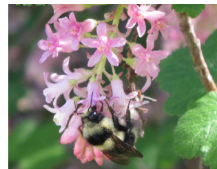
Ribes species and cultivars currant