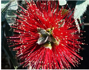
Callistemon species and cultivars bottlebrush