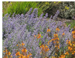
Nepeta x faassenii catmint