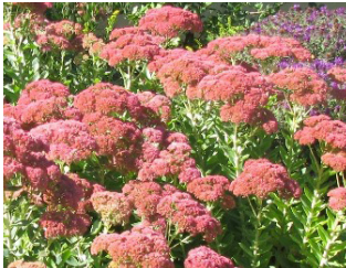
Hylotelephium spectabile 'Autumn Joy' (synonymous with Sedum spectabile 'Autumn Joy') Autumn Joy sedum