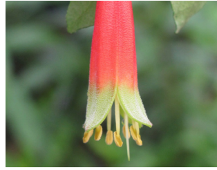
Correa species and cultivars Australian fuchsia