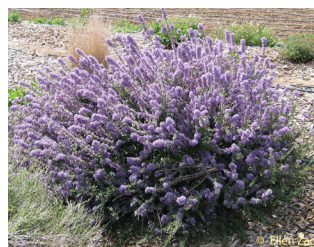
Ceanothus species and cultivars California lilac