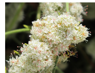
Eriogonum various species buckwheat