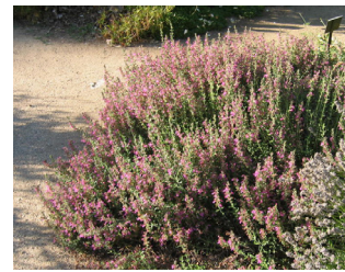
Teucrium x lucidrys dwarf germander