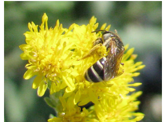
Solidago californica 'Cascade Creek' Cascade Creek goldenrod