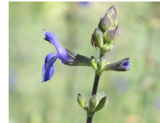
Salvia chamaedryoides germander sage