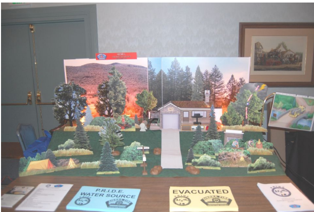
Special Effects table display by the Sierra Fire District.