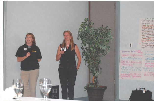
Reporting back from the fire agency break out groups.