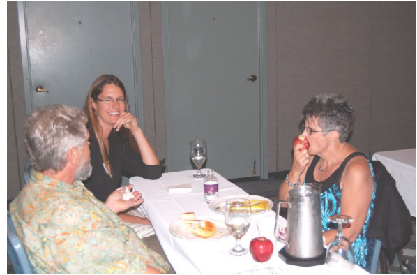
Attendees visit over lunch during the summit.