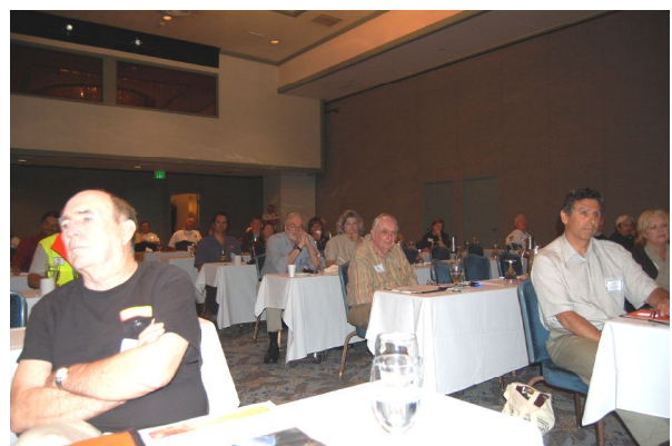
Audience members listen to homeowner panel presentations.