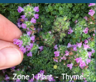
Zone 1 Plant - Thyme

Utilizing native and adapted plants in your garden will require less water, fertilizer, and pesticides and they will ideally thrive in your Tahoe yards and gardens. Natives tend to be slower growing, prefer well drained soils, and overall need less maintenance. Visit www.ucanr.edu/tfg for a list of Tahoe Friendly Plants for each of your defensible space zones.