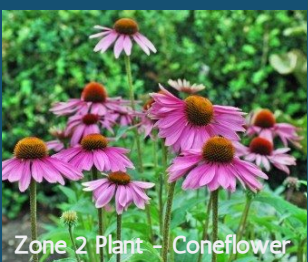
Zone 2 Plant - Coneflower