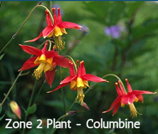
Zone 2 Plant - Columbine