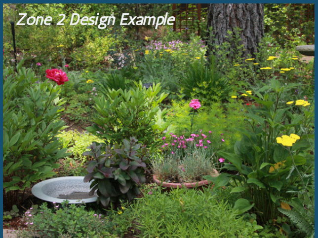
Zone 2 Design Example