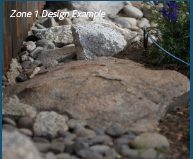
Zone 1 Design Example