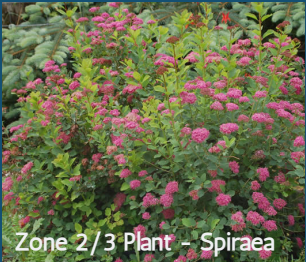
Zone 2/3 Plant - Spiraea