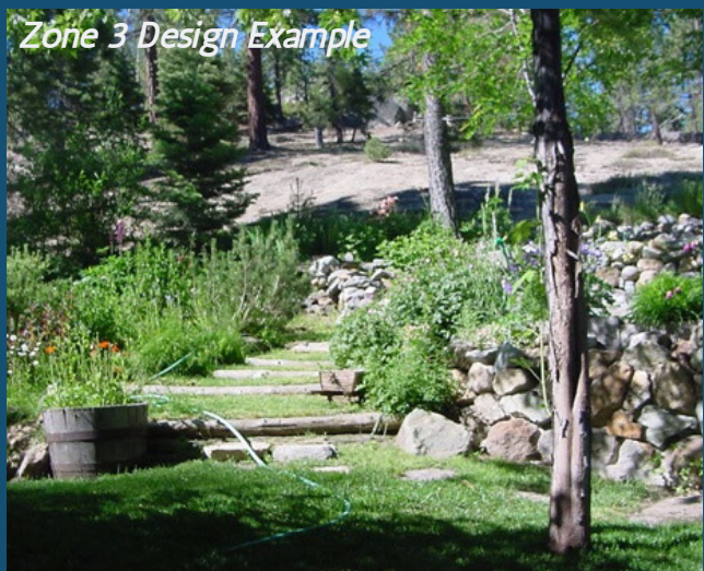
Zone 3 Design Example