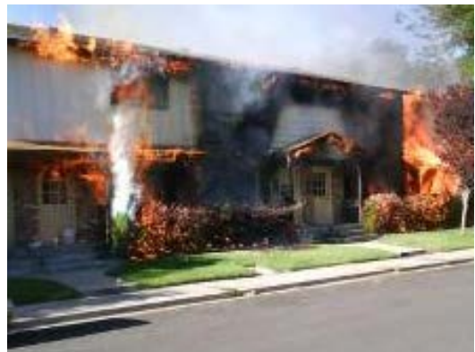
Figure 5 A cigarette thrown out the window into a 'foundation planting' of ornamental junipers burned this apartment in Reno

Hopefully with a few strategic changes in your near home zone, you can make fire safety the 'foundation' of your landscaping.