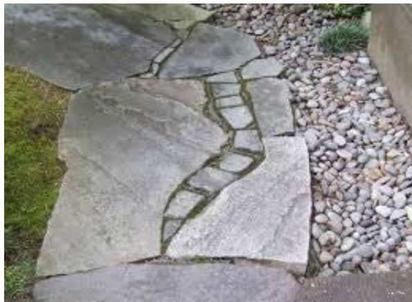
Figure 2 A stone pathway and rock mulch has been installed to create a non-combustible zone

Unfortunately, in a fire prone region like ours, this strategy can increase the risk of your home igniting in a wildfire. Up to 90% of homes that burn in wildfires are ignited by embers, according to the Insurance Institute for Building and Home Safety ( https://ibhs.org/risk-research/wildfire/ ). During a wildfire, embers rain down on a house and start small fires in vegetation. If that vegetation is in contact with the combustible siding of your house, then the small fire started in foundation shrubs can ignite the siding and eventually engulf the house. For a video of this effect in action, see the IBHS website .