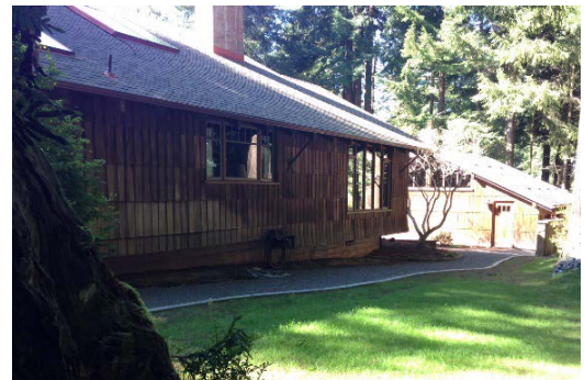
Figure 1 Vegetation has been separated from the house and its combustible siding by installation of an asphalt walkway. (not sure who took this picture)

Do you have foundation plantings around your house? Many of our homes do – either we planted vegetation close to the house’s foundation or it was there when we bought the home. This vegetation is a legacy of the concept of ‘foundation planting’ promoted by landscapers and landscape architects as a way to frame a house and anchor it to the site. A quick review of landscaping websites will reveal that planting trees, shrubs, vines, grasses, and ground covers around a house is still promoted to create a transition between the built environment and the rest of the garden.