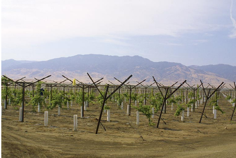
Boron deficiencies are common in the old flood plains and alluvial fans of California's Central Valley. Above, a newly planted table grape vineyard.

grapevines are susceptible to temporary boron deficiency of developing tissues during periods of drought, suggesting limited boron mobility.