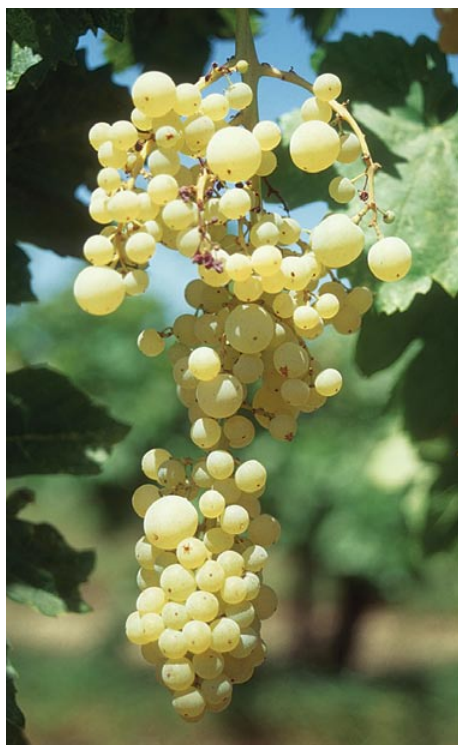
Boron foliar sprays applied in the fall were the most effective treatment to prevent, above, boron deficiency symptoms in grapes.

ments were an untreated control and a foliar boron spray at 1 pound per acre applied as Solubor (20.5% boron) at 100 gallons per acre (gpa). The trial design was a randomized complete block with four-vine plots, replicated 10 times. Vine tissue samples were taken at bloom on May 23, 1998; triple-rinsed with distilled water and oven-dried; and analyzed for boron at the ANR Analytical Laboratory at UC Davis.