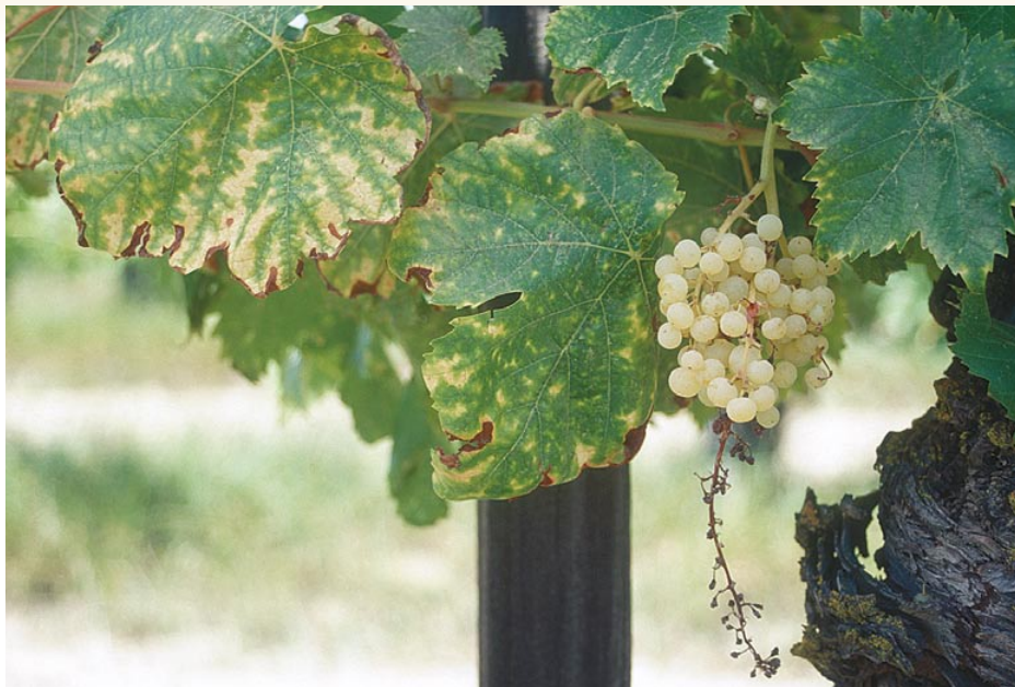
A boron-deficient Thompson Seedless cluster in the trial vineyard shows reduced fruit-set, the presence of numerous pumpkin-shaped “shot berries” and necrosis of some branching. Fewer than 10% of the berries are normal size and shape.

Grapevine reproductive tissues are most sensitive to boron deficiency, which results in reduced fruit-set, small “shot berries” that are round to