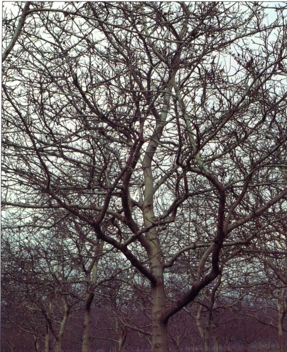
Appearance of walnut tree not pruned for 4 years.

tive, compounds the crowding problem and leads to reduction in nut size and quality.