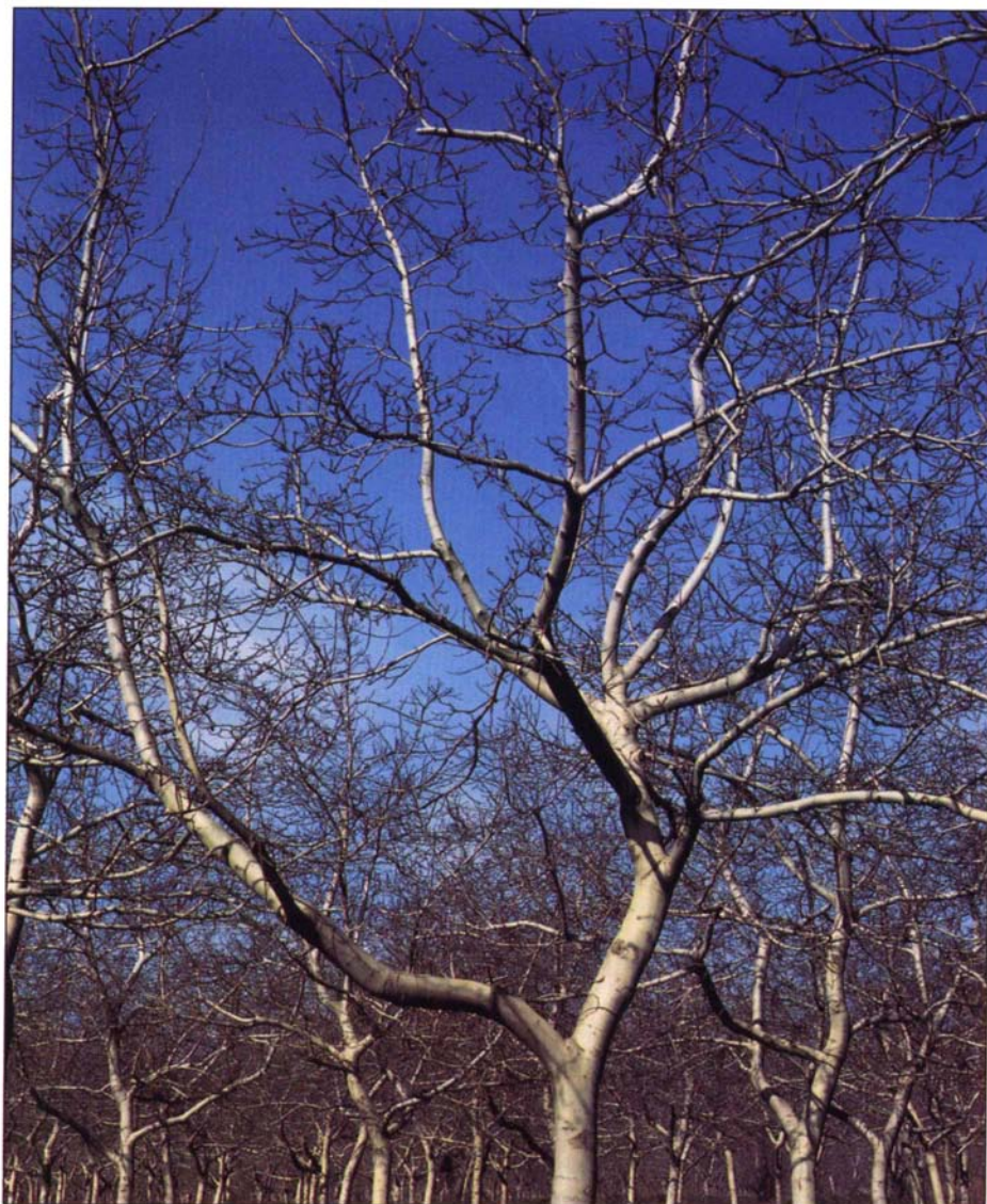
Appearance of walnut tree after receiving annual dormant pruning.

Annual pruning was compared to nonpruning for 8 years and to two alternate-year pruning treatments for 4 years in a mature, full-canopied 'Ashley' walnut orchard. Pruning increased light penetration and subsequent nut distribution throughout the canopy. Nut size and percent edible kernel were consistently lower in nonpruned trees than in trees pruned annually or biennially. However, annual pruning did not improve yield over that of nonpruned trees because fruitful spurs were removed. Alternate-year pruning resulted in yields comparable to those for nonpruned and annually pruned trees in the year following pruning. Biennially pruned trees yielded more than annually or nonpruned trees during the year pruning was not performed. Alternate-year pruning produced the highest income per acre even when the cost of pruning was considered.