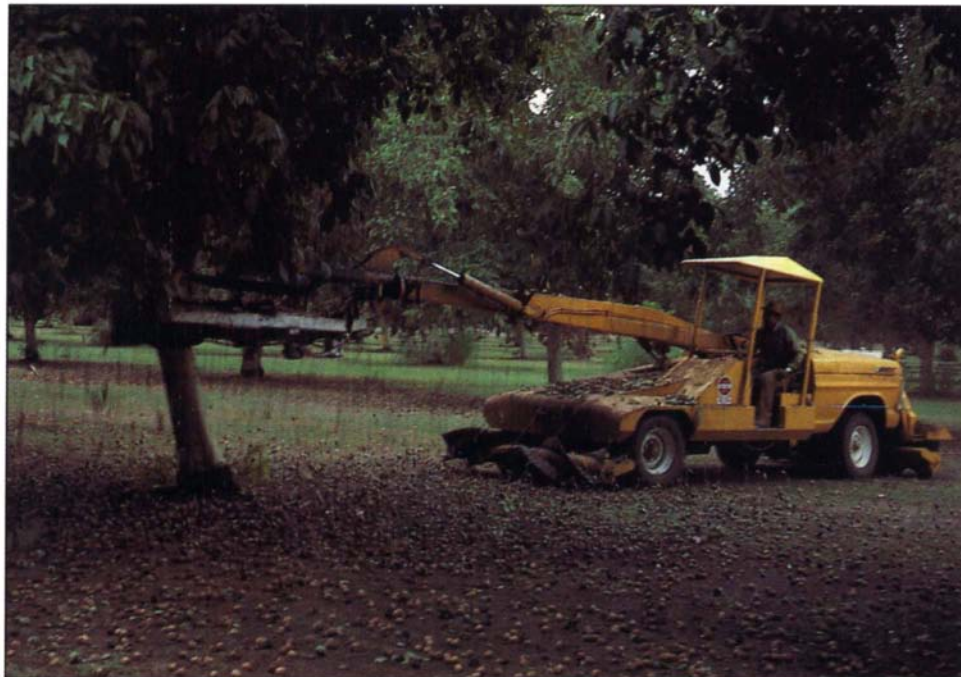
Mechanically shaking the walnut crop off the tree is one of the first steps of harvest.

pruning since pruning was done only every other year.