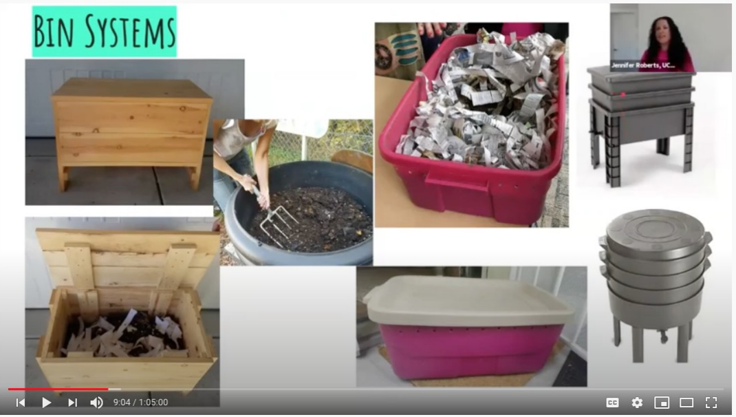
Screen Shot from Virtual Composting with Worms Presentation in English.

Total live participation at all workshops during this timeframe was 272. This makes for an average of 30 people per workshop. This is double our average from last fiscal year.