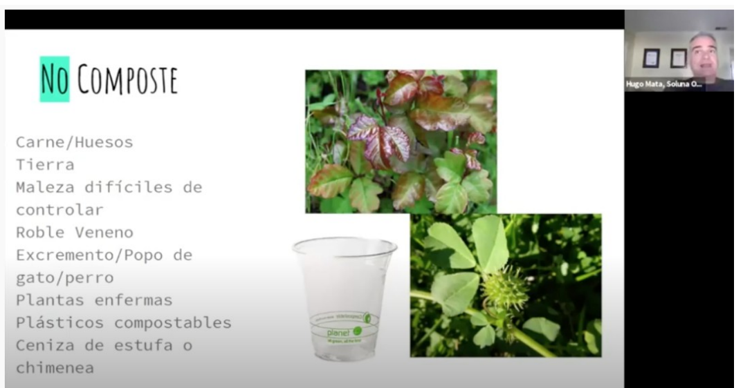
Screen Shot from Virtual Spanish Composting Workshop.

Total live participation at all workshops during this timeframe was 272. This makes for an average of 30 people per workshop. This is double our average from last fiscal year.