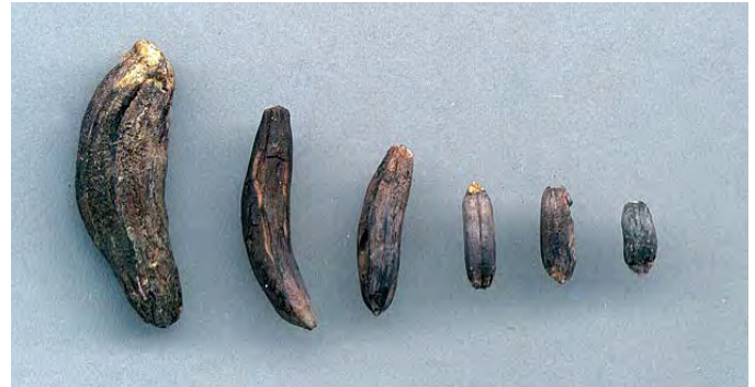
Ergot sclerotia (2x)

more than 0.1% ergot sclerotia (about 1 body in 1000 kernels) should not be fed to growing-finishing swine unless it is diluted to lower levels with ergot-free grain. Ergot concentrations above this level can reduce feed intake, slow growth, and reduce feed conversion. If fed at levels that are too high, ergot can even cause death. Grain containing any ergot should not be fed to breeding stock.