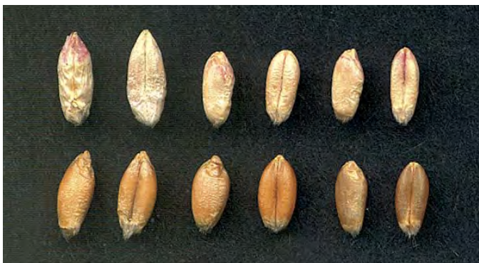
Fusarium graminearum (scab) infection causes small grain kernels to shrivel and take on a chalky white or pink appearance. The kernels in the row at the top of the picture are infested with scab. The bottom row contains normal kernels.

Scab. All small grains can be infected with the fungus Fusarium graminearum resulting in what is commonly called scab. With severe Fusarium infection, the grain becomes shriveled and takes on a chalky white or pink appearance. Scab is most likely to occur under cool, wet weather during early summer. Scabby grain can contain unacceptable levels of deoxynivalenol (DON) or vomitoxin, a mycotoxin associated with feed refusal in swine. Pigs fed diets having harmful DON levels will gain slowly and have poor feed efficiency. Contaminated grain should not be fed to gestating or lactating sows or pigs weighing less than 50 lb. For growing-finishing swine, contaminated grain may be blended with non-contaminated grain to reduce the DON concentration below 1 ppm, usually a no effect level. Cattle and other ruminants may be better alternatives for feeding scab infested small grains because they are less sensitive to DON than swine.