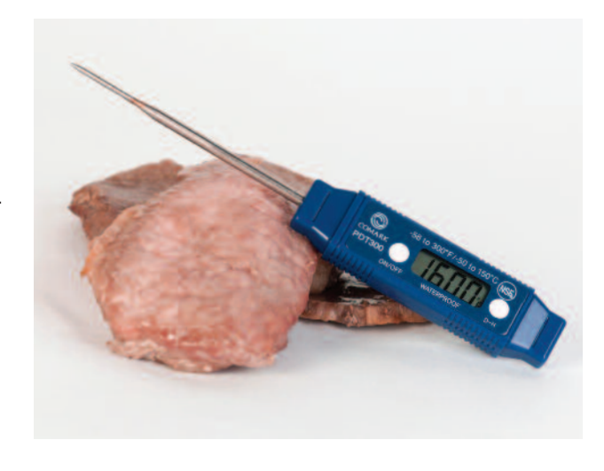
Figure 6. A thintipped thermometer is essential for measuring the temperature of baked meat strips.