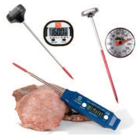
Figure 1. Dial instant-read thermometers (right) sense temperature in the bottom 2 inches of the stem. Digital instant-read thermometers (left and bottom) read temperature in the bottom 1/2-inch of the stem. A thin-tipped thermometer (bottom) can sense the temperature in thin meats.

For measuring the temperature of thin meat, you will need a thin-tipped digital thermometer (figure 1). Look for these in specialty cooking stores.