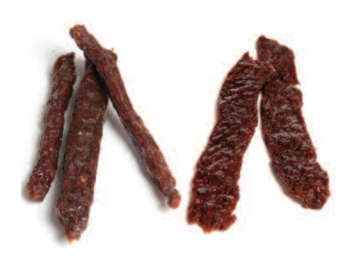
Figure 3. Jerky made from ground beef formed into logs (left) and strips (right).

Ground meat jerky. Ground meat is generally flavored by mixing in spices, including salt, before being shaped into strips. Salt helps bind the ground meat together so that it holds its shape. Jerky guns or shooters work well for shaping ground meat (figures 2 and 3). You can also press meat into a jellyroll pan to a thickness of ¼-inch thick and slice it into strips.