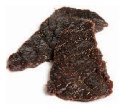
Figure 5. Jerky produced using the hot pickle cure recipe.

Putting unmarinated strips directly into the boiling marinade minimizes a cooked flavor and maintains the safety of the marinade.