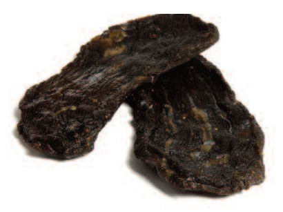
Figure 4. Traditionally produced jerky is heated in an oven (275°F for 10 minutes) to make sure it is safe to eat.

This method is the easiest way to produce safe jerky (figure 4). After whole muscle or ground meat has been seasoned according to your taste and dehydrated, use tongs to immediately place the dried meat strips on a baking sheet, close together but not touching or overlapping. Heat the meat strips in a preheated 275°F oven for 10