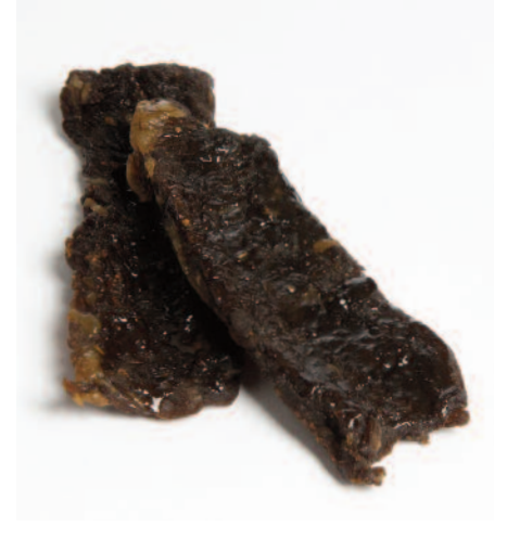
Figure 7. Jerky produced using the vinegar marinade recipe does not require post-drying heating of the jerky or pre-cooking of the meat for safety.

This method is not recommended for game meats, as its effectiveness in killing Trichinella has not been studied.