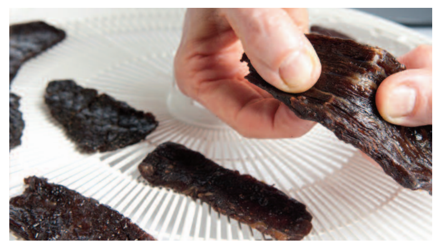
Figure 8. Properly dried jerky should crack but not break when bent.

Properly dried jerky is chewy and leathery. It will bend like a green stick and won't snap like a dry stick. It should not have damp spots.