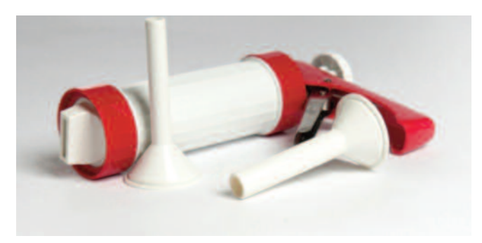
Figure 2. A jerky gun helps shape ground meat.