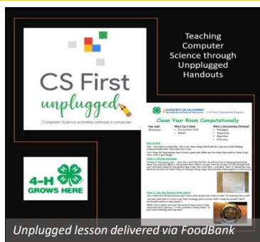
Unplugged lesson delivered via FoodBank

To ensure youth with limited or no access to the internet are engaged in Santa Barbara County, 4-H partnered with the Santa Barbara FoodBank. Together we delivered over 1,388 unplugged activities to youth in Santa Barbara County. When youth picked up their meals through the feeding program, they were also able to pick up fun and engaging activities they could do safely from the comfort of their own homes. Many of these activities focused on teaching youth about computer science through computational thinking.