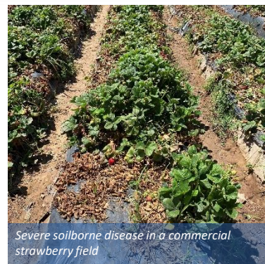
Severe soilborne disease in a commercial strawberry field