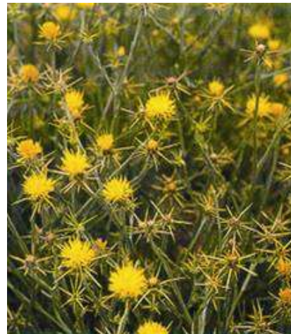
Full Flowering stage