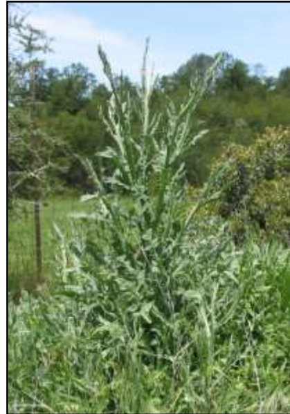
Late Bolting stage