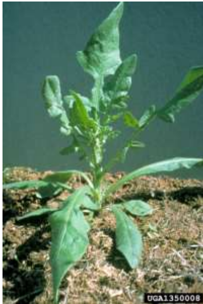
Early Bolting stage