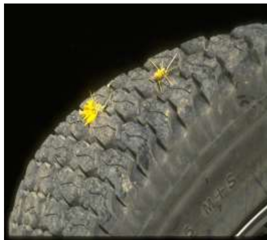
How is Yellow Starthistle spread?