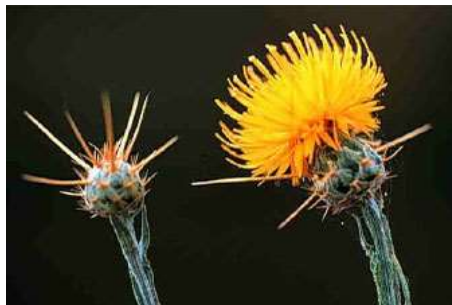
Flowering stage – seed head