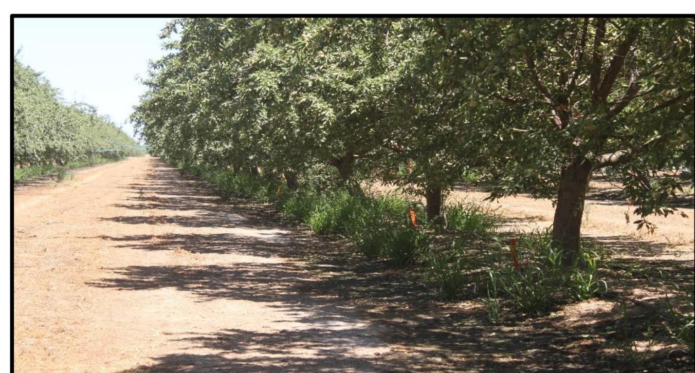
Fig. 1. Glyphosate-resistant junglerice in an almond orchard in California.

INTRODUCTION: Junglerice is a problematic weed in annual and perennial cropping systems in California. Moreover, in recent years, presence of glyphosate-resistant (GR) junglerice populations have compromised the effectiveness of glyphosate, a popular POST herbicide in orchards and vineyards (Fig. 1). Hence, there is a need to identify other effective postemergence herbicides. However, it has been observed that the efficacy of POST herbicides often vary according to the micro-environment of orchards and vineyards, especially shade and soil moisture conditions. Therefore, the influence of these micro-environments on efficacy of POST herbicides on junglerice needs to be evaluated.