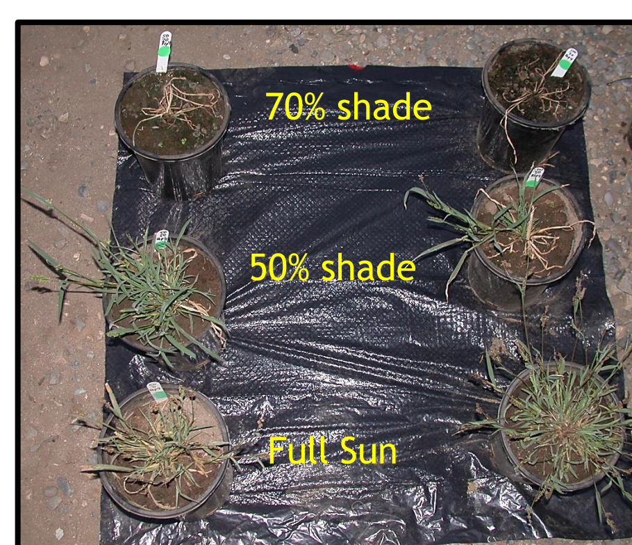
Fig. 3. Plants treated with glyphosate at 50% FC (L) and 100% FC (R) under different levels of shade.