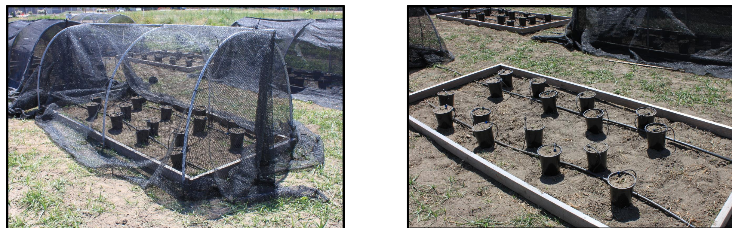
Fig. 2. Potted junglerice plants under different levels of shade (L) and soil moisture (R).