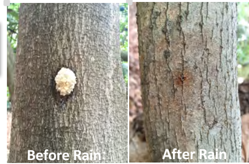
Fig 1. Symptoms of Shot hole borer on avocado