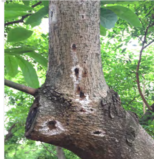
Fig 2. Beetle infestation on an avocado branch collar but no cluster