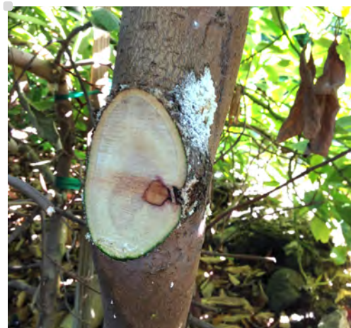
Fig 4. Pruning of infested branch collar