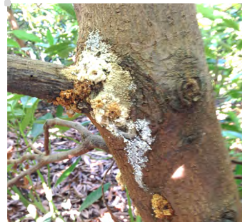
Fig 3. Beetle infestation on an avocado branch collar with cluster