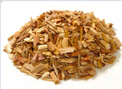
Fig 6. Chip infested pruning wood