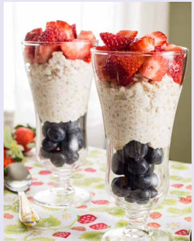
▲ Fourth of July Parfait