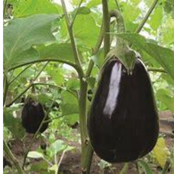
Black Beauty, Nadia