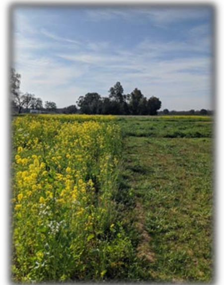
Photo 1: Project Apis m. mustard mix (left) in March 2020 used as a field border conservation buffer at the NRCS Plant Materials Center in Lockeford, CA.

Currently, the UCCE is working on a California Department of Food and Agriculture-funded Healthy Soils Demonstration project at the Lockeford Plant Materials Center to evaluate how plant establishment, growth, and maintenance influence soil health within field borders ( Photo 1 ). This randomized and replicated trial will compare the ability of different types of grasses and brassicas to become established along the edge of a cropped field. This project was started in the fall of 2019 by broadcast seeding companion sod at 60 lbs. of pure live seed (PLS) per acre, creeping wildrye at 20 lbs. PLS/acre and Project Apis m. (PAM) mustard mix at 12 lbs. PLS/acre into plots measuring 50 feet wide by 55 feet long. Prior to broadcast seeding, soil samples were taken randomly from within the field border area to quantify soil chemical and organic matter conditions at the start of the project. Results revealed this fine sandy loam soil had an average initial pH of 6.8 and soil organic matter content of 1.5%. The effect of plant growth and establishment on soil pH and organic matter, as well as microbial activity, water infiltration, and bulk density will be measured until the spring of 2022. The overall goal is to have a better understanding of the short-term impacts of field