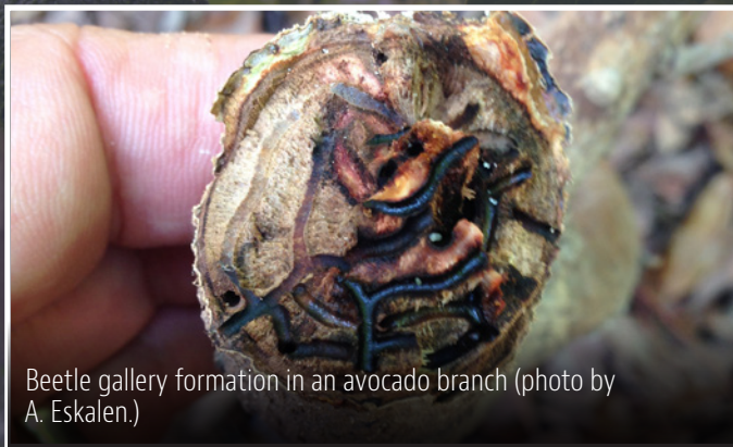
Beetle gallery formation in an avocado branch

transportation of materials is necessary, it must be covered (UC IPM 2017).