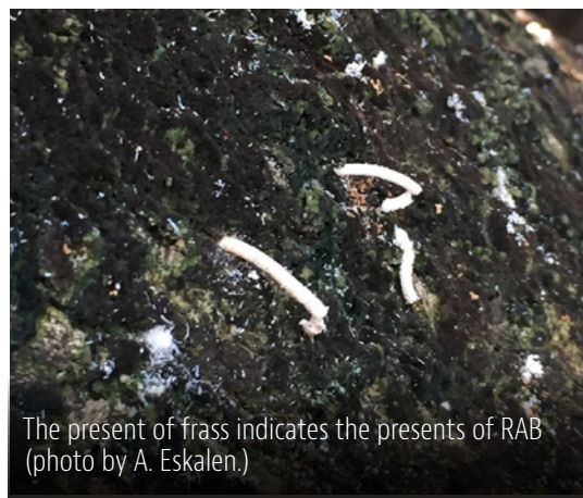
The presence of frass indicates the presence of RAB