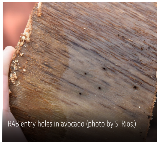
RAB entry holes in avocado