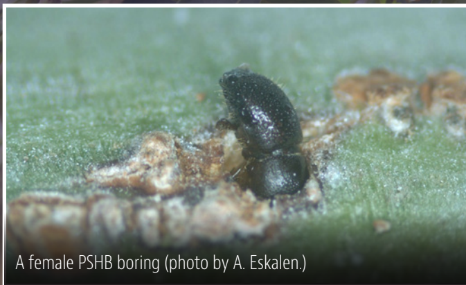
A female PSHB boring