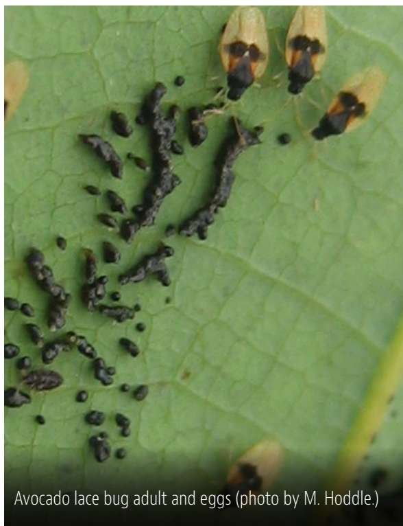
Avocado lace bug adult and eggs

ALB restrict their feeding to the undersides of leaves. Feeding initially causes small white or yellow spots on the surface of the leaves as individual cells dry out. These necrotic areas look like tip-burn caused by excessive salts, but in this case, the necrotic areas are islands of dead tissue in the interior of the leaf surrounded by living tissue. It is suspected that feeding damage can provide entrance for pathogenic fungi, in particular Colletotrichum spp., which are leaf anthracnose fungi. As lace bug colonies grow, brown necrotic areas develop where there has been heavy feeding damage. Heavy feeding can cause striking leaf discoloration and early leaf drop (Hoddle 2004; Hoddle et al. 2005). Avocado lace bug nymphs and adults do not feed on fruit. However, heavy feeding damage to leaves will likely have a detrimental effect on yield, which may result from the loss