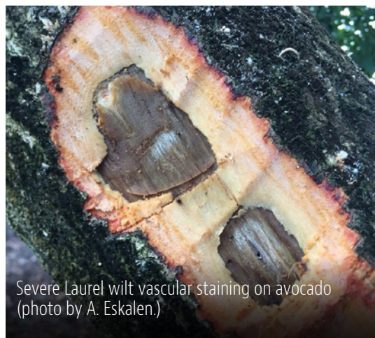
Severe Laurel wilt vascular staining on avocado

The Florida avocado industry has implemented a universal detection and suppression program with the goal of preventing or limiting the incidence of