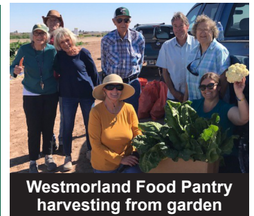
Westmorland Food Pantry harvesting from garden