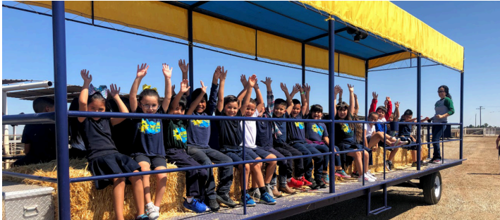
Canceled field trips due to COVID-19 restrictions resulted in approximately 2,244 less participants

University of California | Desert Research and Extension Center