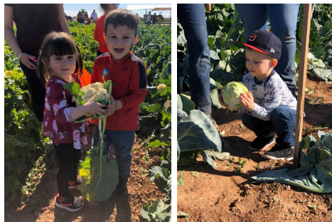
2 nd annual Farm to Preschool Festival offers hands-on experiences with agriculture