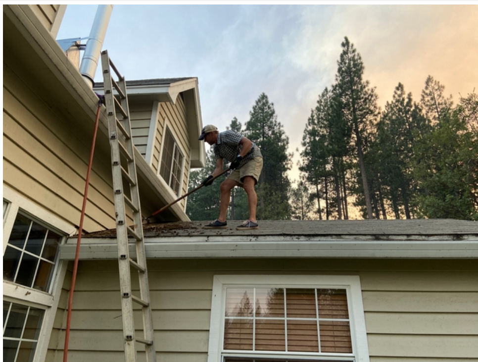
Don't forget to clean your roofs and gutters of any moss, vegetative debris, or leaf litter. Here the author wishes he did this in May rather than waiting until August with wildfire smoke looming in the background.

May also brings great weather to work out in the yard (defensible space) and work on the house (home hardening)! The UCANR Fire in California website has helpful science-based information for homeowners on defensible space, reducing fuels, fire-safe landscaping, and how to prepare your home to be resistant to wildfire. Walk around your home and yard and look at where all your leaves accumulate...those eddies might be the same area an ember might land: Would it burn anything? Pick a project or two that you think is affordable and attainable and make it happen. Very few of us have the money or time to improve everything in a month, but doing what we can still moves the needle on preparedness.