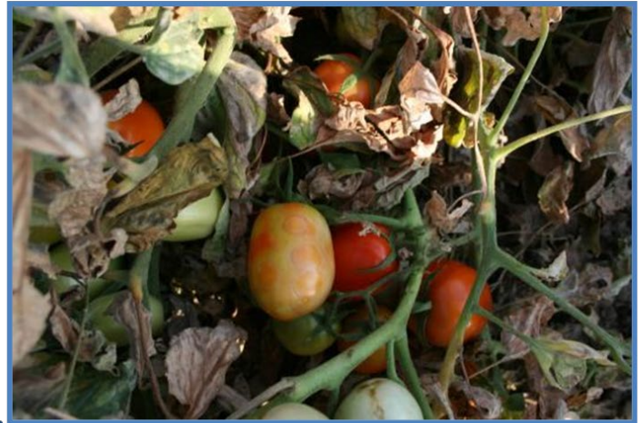
2 fruit symptoms with few foliar symptoms