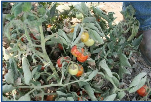
3 systemic symptoms through leaves and fruit