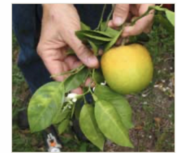
Symptoms of HLB on leaves and fruit (right).