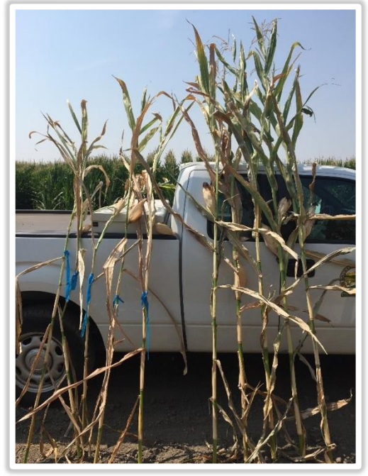
Figure 1. Chronically droughtstressed corn (left) is shorter with thinner stalks and poorly developed ears and tassels.