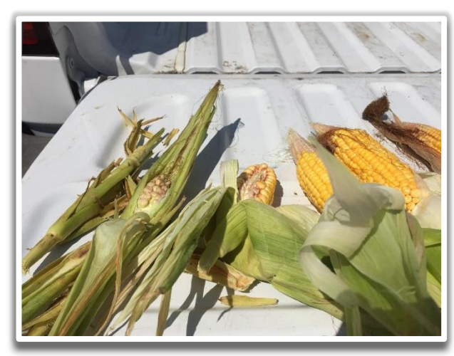
Figure 2. Acute drought stress during corn pollination can cause poor grain set and ear formation (left).

Figure 1. Chronically droughtstressed corn (left) is shorter with thinner stalks and poorly developed ears and tassels.