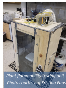
Plant flammability testing unit

The Reimagining Defensible Space Project, supported by UCCE in Santa Barbara County, built a plant flammability testing unit. The project will create science-informed recommendations on wildfire-centric plant maintenance, species selection, and placement. In collaboration with the Santa Barbara Botanic Garden, the project team will develop a list of native species for combustion testing to inform policy decisions on plant selection and defensible space.