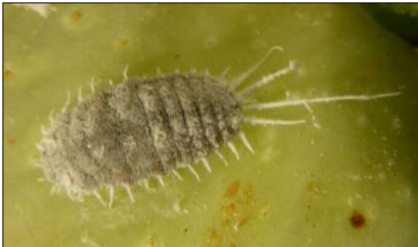
Figure 2: Top: Gill's mealybug. Bottom, Grape mealybug.