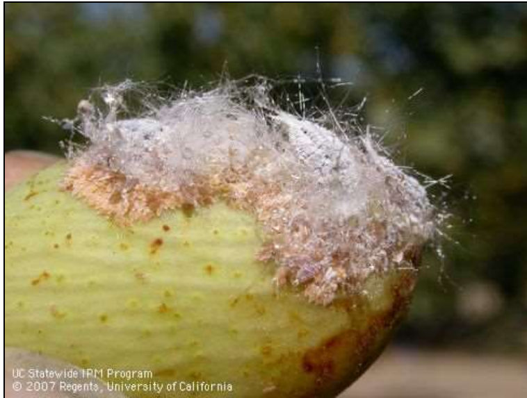
Figure 3: Gill's mealybug adults with first instar nymphs (crawlers).