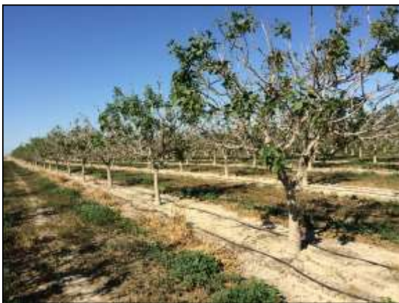
Figure 3. Low chill accumulation is associated with delayed, protracted bud break, bud abscission, bare zones on branches, and poor nut set.

Many temperate crops, including pistachio, require a cumulative amount of chilling to exit dormancy in the spring. The chilling requirement is a physiological mechanism that protects buds from the winter cold. Without a chilling requirement, budbreak could occur during intermittent winter warming events, thus exposing open buds, flowers, or shoots to cold conditions that may limit survival of the structure. Chill hours are not calculated on a continuous basis, but rather accumulate in a cumulative fashion throughout the winter.