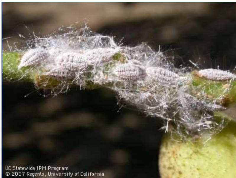
Figure 1: Gills mealybug adults feeding on a pistachio rachis.

Gills mealybugs directly impact the pistachio crop by reducing yields and split percentage and increasing shell staining. They may cause increased sticktights and adhering hulls, though this has not been conclusively shown in research studies. Mealybugs cause this damage by feeding on the phloem, consuming carbohydrates that the pistachio would otherwise use to fill the nuts or develop new growth. They also produce honeydew that can harbor growth for sooty mold. This is not considered detrimental to pistachios, though it does look dramatic at harvest time.