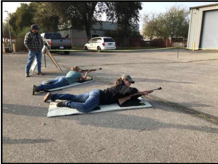
4-H Shooting Sports Workshop Rifle Discipline at UCCE Kern County Members from Sierra Mountaineers 4-H Club participating