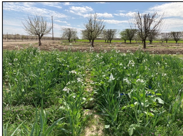
Photo 1. A picture of a soil builder plot containing triticale, peas, vetch, and radish in March 2021 at the Kearney Agricultural Research and Extension Center.