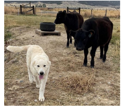
Bonding LGDs to cattle, Modoc County.