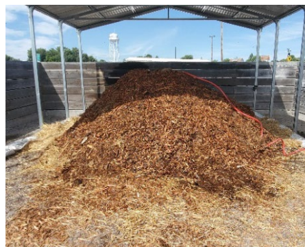
Carcass composting research, Intermountain Research and Extension Center, Siskiyou County.