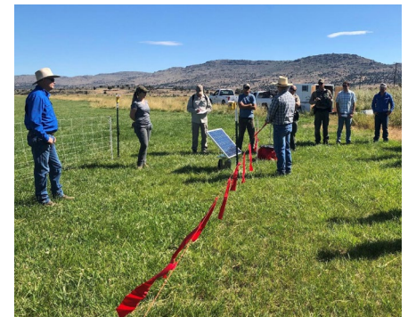
Field day demonstrating fladry use, Lassen County.