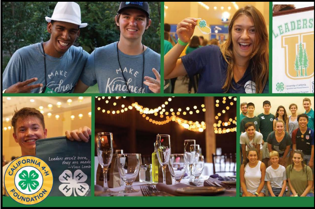
Annual 4-H Alumni & Friends Night Out