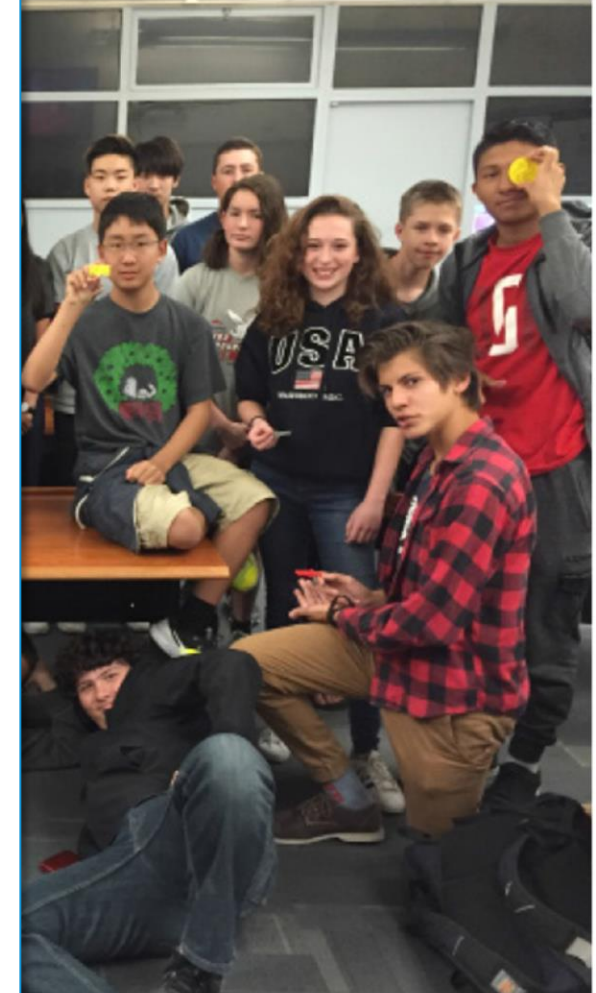
Robotics Club pictured with their desktop 3D Printer.

In 2016, thirteen COSMOS Teacher Fellows were selected. Teacher Fellows are eligible and encouraged to apply for this award by 11th at 6pm. Contact cosmos@ucop.edu for more info.