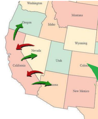
Moving In – Out of State