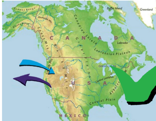
Moving In – Out of Country