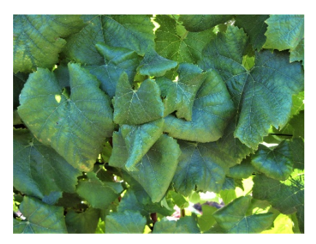
Grape leaves with symptoms of Leafroll Disease, which affects fruit ripening and vine health.

During the 2021 program year, the UCCE-Napa Viticulture Team reached 967 grape growers and crop consultants at educational events including workshops, field days and online seminars. This included sharing research and educational content critical for leafroll disease management, one of the most economically consequential viral diseases of grapevine worldwide. Grower surveys indicated that 89.6% had adopted at least one management practice for leafroll disease, with a median of 80% of all recommended best practices currently adopted. By delivering evidence-based management strategies and diverse educational opportunities, Napa grape growers have "all the resources at [their] disposal ... [and are] not really spending a lot of money on leafroll management like [they] were ten years ago".