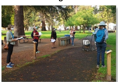
Tree Walks are one of the many educational events provided by the UC Master Gardeners to the Napa Community

UC Master Gardeners of Napa County shifted their four times per month workshops from in-person to an online zoom format. The 32 zoom sessions, on a diversity of home gardening topics were offered through preregistration. The sessions were recorded and added to the online repository of content posted on the <a href="UC Master Gardeners of Napa County workshop webpage">UC Master Gardeners of Napa County workshop webpage</a>. These programs, combined with four outdoor guided tree walks, reached over 900 people. The UC Master Gardeners' Help Desk similarly shifted from in-person staffing three days a week to remote access by phone and email. This was extremely successful providing faster responses to home gardening questions