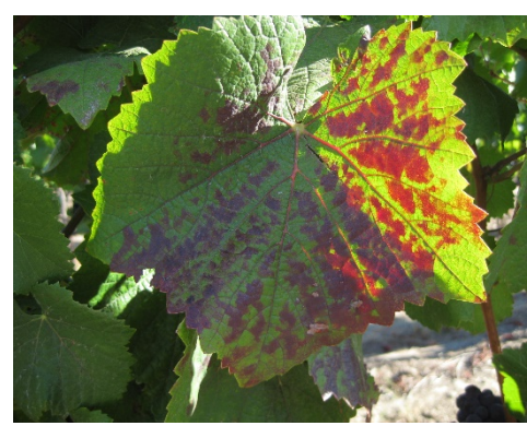
Pinot Noir leaves with Red Blotch Disease

The economic impact of grapevine red blotch disease (GRBD) is estimated to be as high as $27,740/acre in Napa County. The three-cornered alfalfa hopper (TCAH) can spread the virus that causes GRBD in the vineyard. Many vineyards till under their ground cover in the spring and being able to time this tillage to occur before TCAH adults emerge can help reduce their populations. Our IPM Program Team developed a degree-day model to determine the ideal time to till under ground cover to have the most impact on reducing TCAH populations. The model was validated in Oakville, Calistoga, Mt. Veeder, Glen Ellen, Geyserville and Healdsburg. Tillage is recommended between 1310 and 1565 °C accumulated degree-days, which is the timeframe when ~25% to ~80% of immature stages are present on the ground cover. This model is accessible on the UCIPM website,