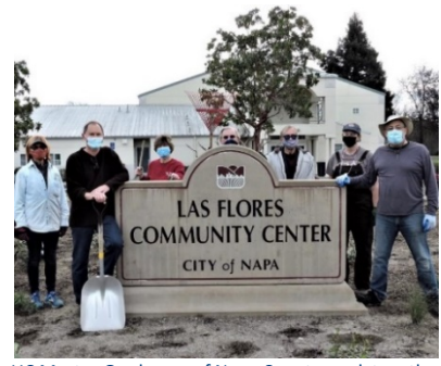
UC Master Gardeners of Napa County work together on the Las Flores Learning Gardena collaborative effort with the City of Napa

Our Cooperative Extension (UCCE) county-based advisors, community education specialists, and campus-based academics work as teams to bring practical, trusted, science-based solutions to our state. We are problem solvers, catalysts, collaborators, educators, and stewards of the land, living in the communities we serve.