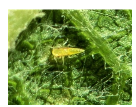
Leafhopper feeding damage is an economic concern for Napa Valley Vineyards.

The leaf damage caused by Virginia creeper and variegated leafhoppers affects photosynthesis and ripening. These insects are also a nuisance to workers performing canopy management and are particularly difficult to manage organically. We experienced massive leafhopper populations in spring 2021. At bloom, the UCCE-Napa Viticulture Team initiated a monitoring and organic treatment program. By mid-summer, we had reduced leafhopper populations to below-detectable levels, preserving the canopy and ensuring even ripening of the fruit. This program shows promise to reduce economic impacts of vineyard leafhoppers in organic wine grape production.