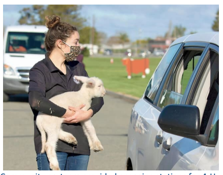
Community partners provided engaging stations for 4-H youth at the Youth Animal Science Event.

The Napa 4-H Youth Development Team hosted a Youth Animal Science Drive-Thru at the Sonoma-Marin Fairgrounds. This event was designed to educate youth and their adult leaders, teachers, and mentors about livestock animal production in the areas of cattle, sheep and goats, and poultry. Each track had five interactive stations designed to highlight various topics including biosecurity, production, husbandry, ecosystem services, nutrition, food safety, and fire preparedness. Speakers included members of UC Cooperative Extension, Santa Rosa Junior College, Sonoma Marin Cattlewomen, North Bay Dairy Women, Sonoma-Marin and Napa County Young Farmers and Ranchers, Halter Project, and 4-H leaders and members.