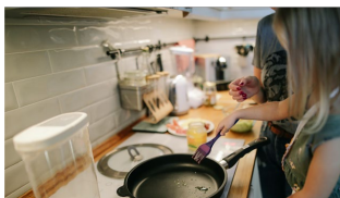
Youth practicing cooking skills at home with family