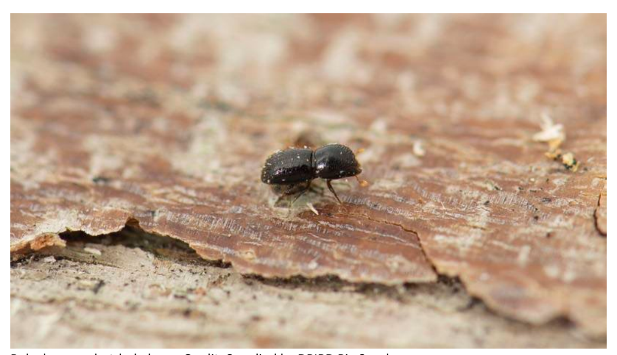
Polyphagous shot-hole borer

A tiny but highly destructive exotic beetle has been detected in Perth trees, prompting the State Government to ban garden waste movements across 17 Perth councils as it determines the extent of the spread.