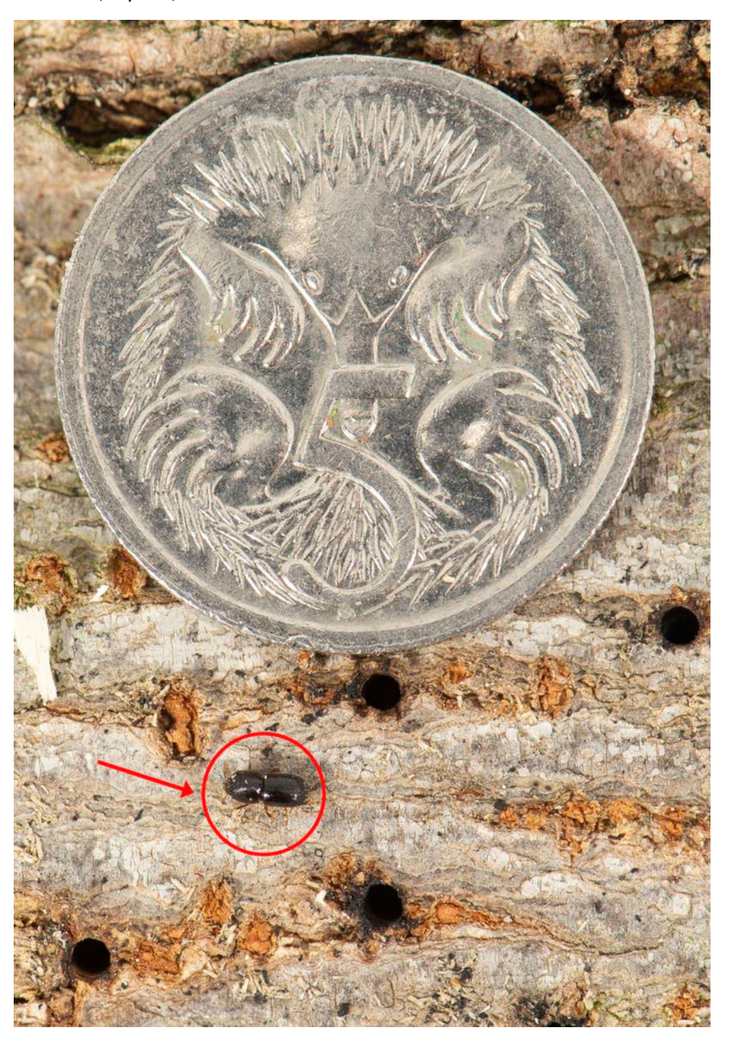
Polyphagous shot-hole borer

Just 2mm in size, the pest was first detected in East Fremantle in August, after a resident reported signs of dieback and dead branches in their maple tree. Since then, further borers have been detected in Claremont, Myaree, Dalkeith and Attadale.