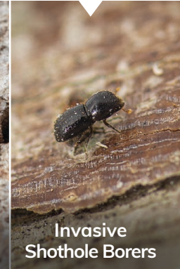
Invasive Shothole Borers

Protect your landscaping investments and learn best management practices for these non-native insects.