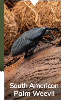
South American Palm Weevil