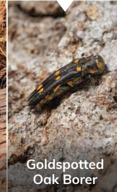
Goldspotted Oak Borer